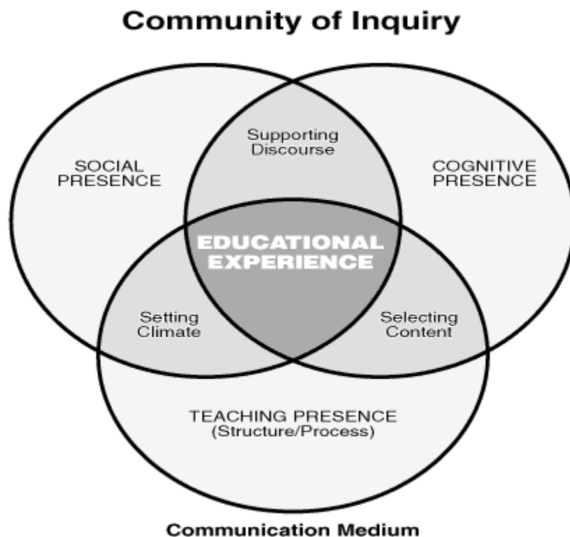
Figure 1. Elements of an educational experience (Garrison, Anderson, & Archer, 2001).

In its original formulation, the three presences were represented as overlapping and interacting processes that determined the quality of the online learning experience. The now-familiar diagram is shown in Figure 1 below.