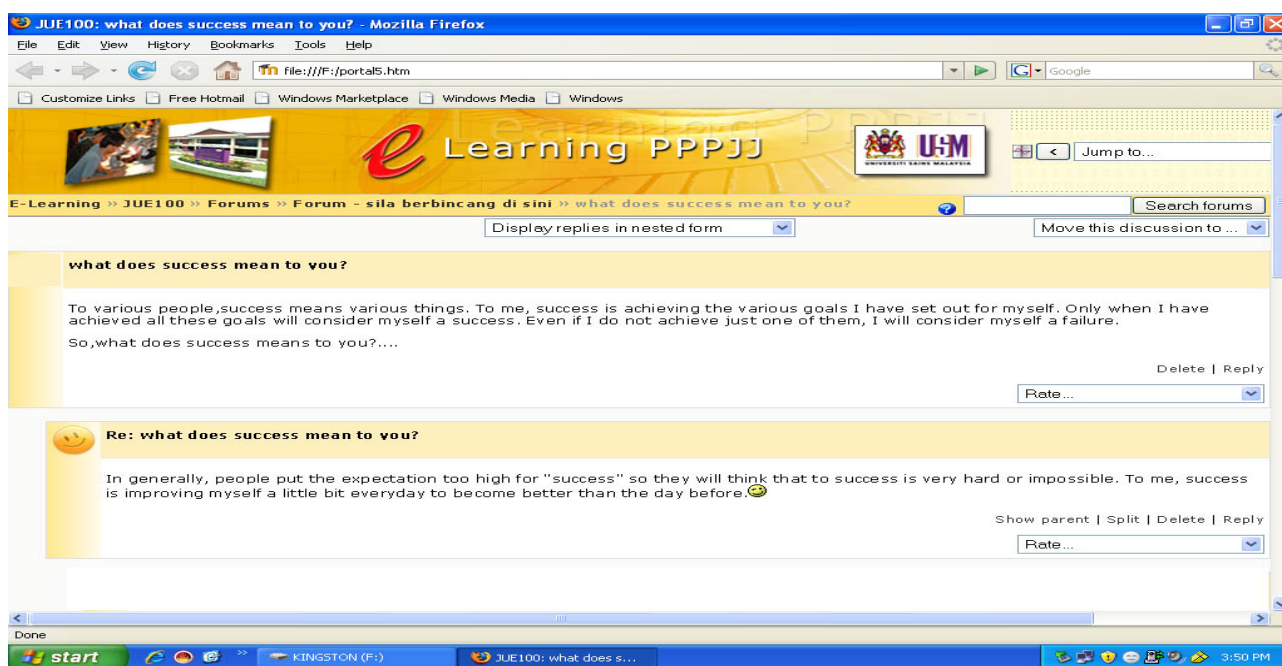
Figure 2. Samples of student postings.