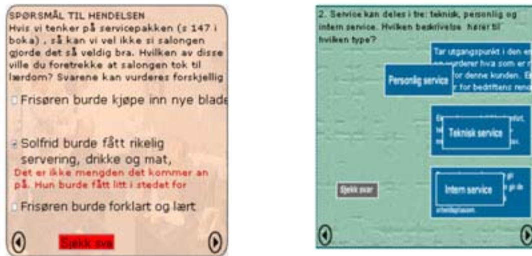
Figure 4. Screen shots from the PDA of multi-media multiple-choice question and 'drag-and-drop' assignment.

It was clear during internal testing that the solutions functioned according to expectations; they allowed all students in the course, irrespective if they were mobile or tied to a desktop computer, to participate and communicate in the same course. However, because additional materials had to be developed specifically for the mobile learners, we found that these solutions could never be applied cost-effectively on a large scale.