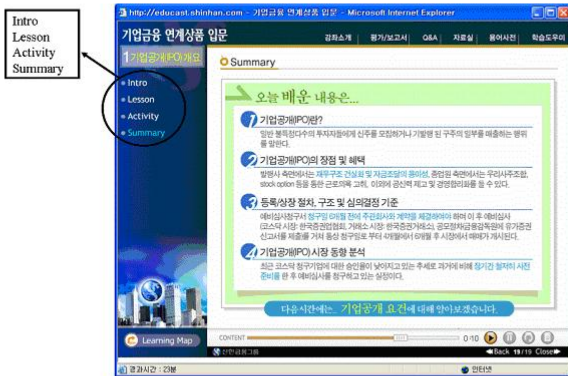
Figure 1. An Example of e-Learning: Tutorial type

Table 2 shows that nearly 90 percent of all e-Learning content in 2005 were tutorials in either HTML or Lecture-on-Demand (LOD) format. The remaining 10 percent were simulations that honed technical skills. As these two types – tutorials and simulations – became so ubiquitous over the past three years in the field of corporate e-Learning, the government's Employment Insurance Fund eventually dropped support for other types of e-Learning programs.