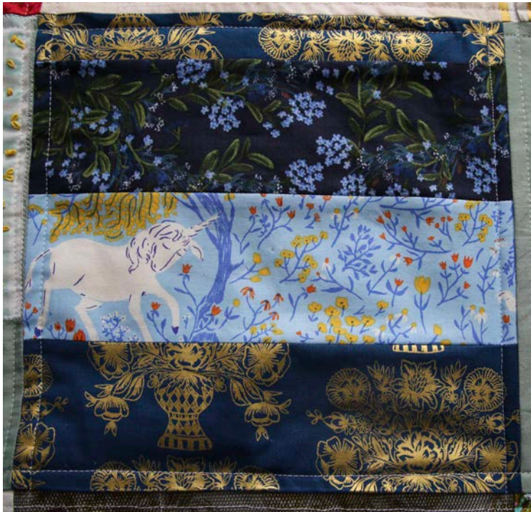
Figure 1: Blue. Corinna Peterken.