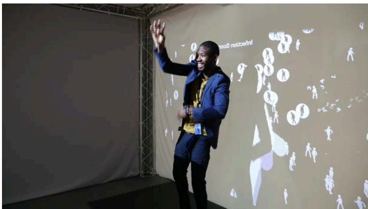
Figure 1: Shadowpox player at the <Immune Nations> exhibition opening, UNAIDS, 2017.