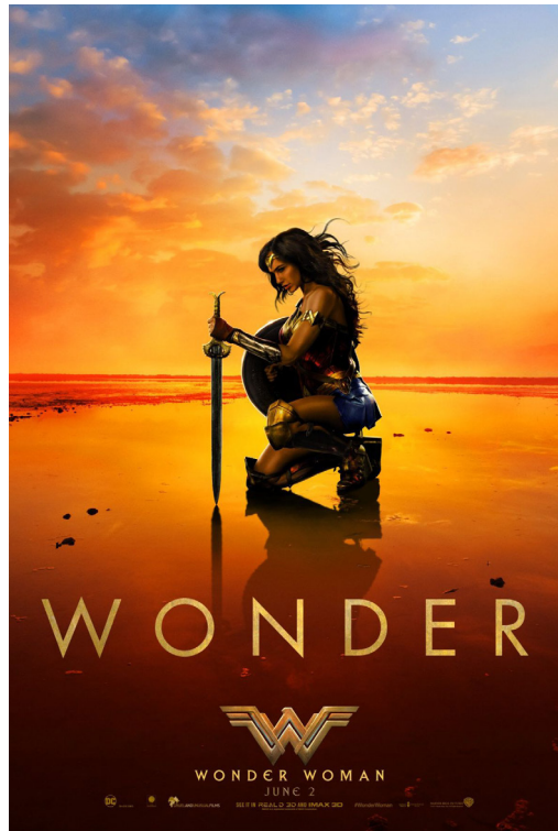
Figure 4. Gal Gadot in the Wonder Woman costume created for the 2017 Wonder Woman film.

In 2016, Wonder Woman was assigned both her biggest and potentially most controversial role yet: as United Nations Ambassador of the Empowerment of Women and Girls. As Veronica Arreola writes, this appointment sparked intense debate: "While many are fans of Wonder Woman, they would rather see the UN finally select a real-life woman to lead the global entity." Importantly, Wonder Woman's costume was cited as one of the concerns with the appointment. Again, Wonder Woman is described as being "scantily clad," making her "not suitable for an ambassador" (Arreola). The United Nations' Wonder Woman campaign had been accompanied by slogans, such as "Think of all the wonders we can do: stand up for the empowerment of women and girls everywhere" and "The women and girls who rise up for a better world, and the men and boys who support and stand