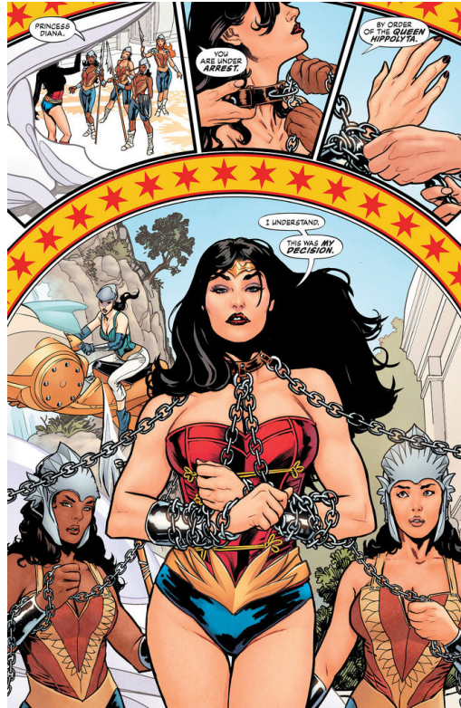
Figure 2. Wonder Woman restrained with chains in the Wonder Woman: Earth One series. Grant Morrison (w) and Yanick Paquette (a), Wonder Woman: Earth One (April 2016), DC Comics; Richard Guion, "Wonder Woman- Yanick Paquette," Flickr, 1 April 2016, www.flickr.com/ , accessed 31 July 2018.

playing on Wonder Woman's status as a feminist figure and its potential negative consequences (130). For Wonder Woman, consumerism dilutes the strength of her feminist message.