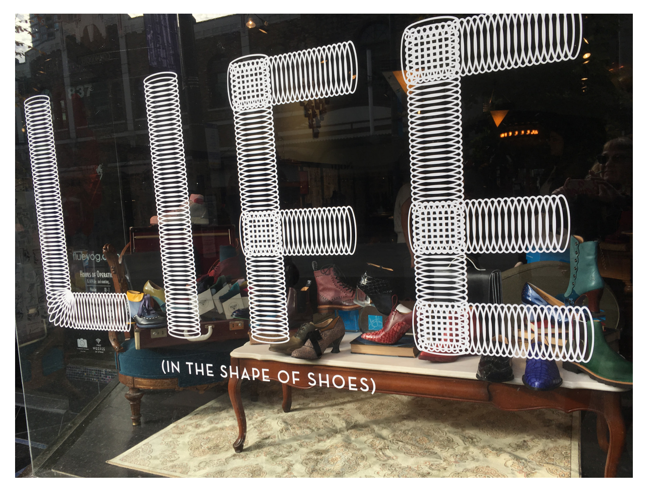
Elena Siemens, Fluevog Vancouver (2016)

Yellow Brick Road," "fashion is imagined," "fashion is lived," "fashion is air travel," and "fashion is the Fluevog store on the rain-swept Granville Street in Vancouver."