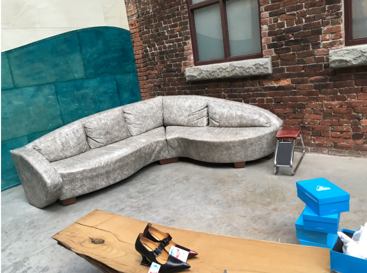
Elena Siemens, Fluevog Vancouver (2016)

In Gucci's vision of retro-future, one can be thankful that Seinfeld's and Star Trek's vision of the one-piece uniform with boots never comes to pass, instead, human characters togged out in a dazzling array of textures and colours which comprise of the Gucci Fall 2017 campaign greet extra-terrestrials and battle dinosaurs on Earth's pre-history before being beamed up to psychedelic starship juxtaposes high fashion with sci-fi in a wild, never before seen fantastical composition which underscores how brilliant the commentary is. (Ho)