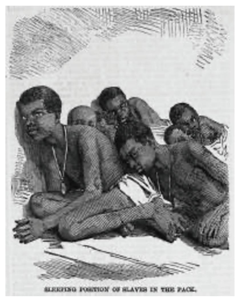
Fig 2. Unknown, Sleeping Position of Africans on Slave Ship , illustration from The Illustrated London News , vol. 30, June 20, 1857, p. 594.

to packing people into the hold. The limited room<sup>29</sup> meant that captives contorted to their new realities. With their bodies constrained, did they escape in dreams? Did they have collective visions? (See Fig. 2).