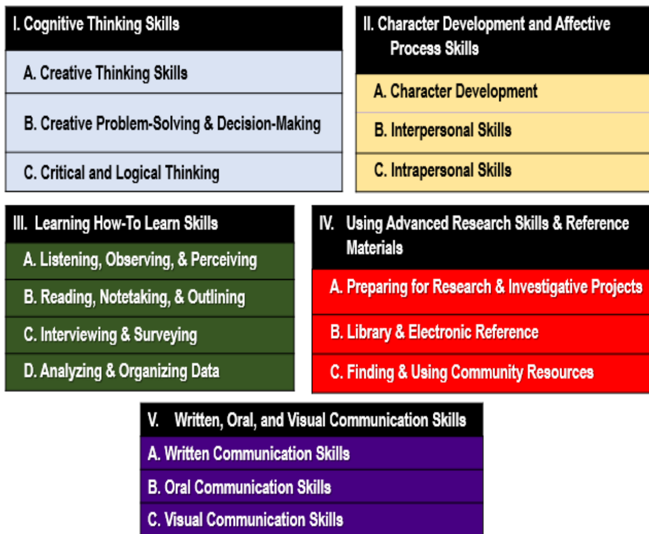
Figure 4: Taxonomy of cognitive and affective processes.

The goals of Type III enrichment include: