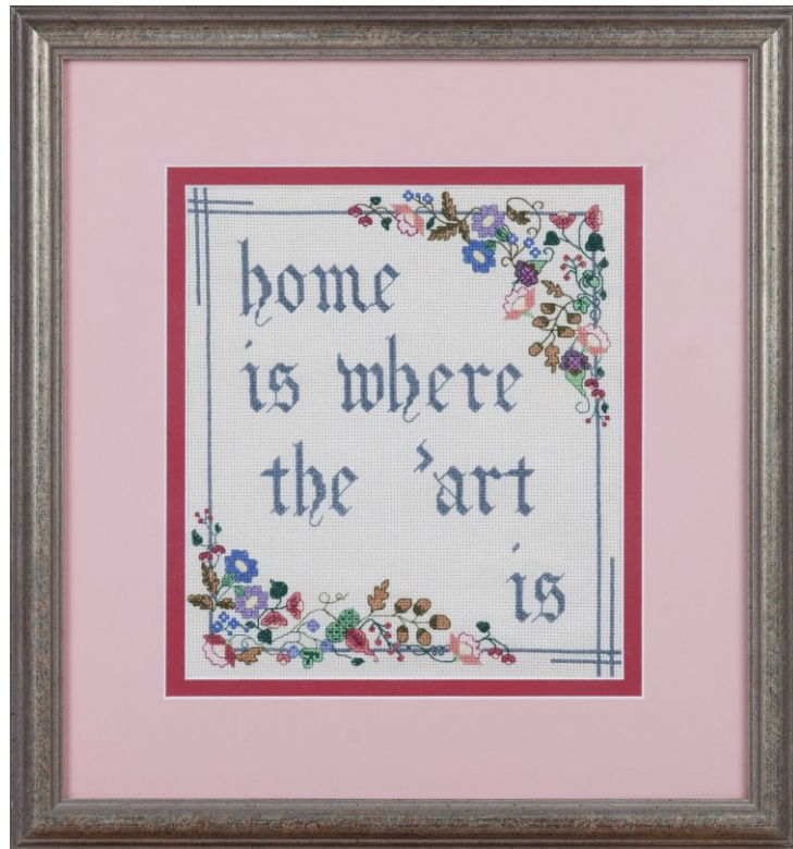
Figure 8: Beverley Hayward, Sewing Sampler: Home Is Where the Art Is, 2014, tapestry, private collection.