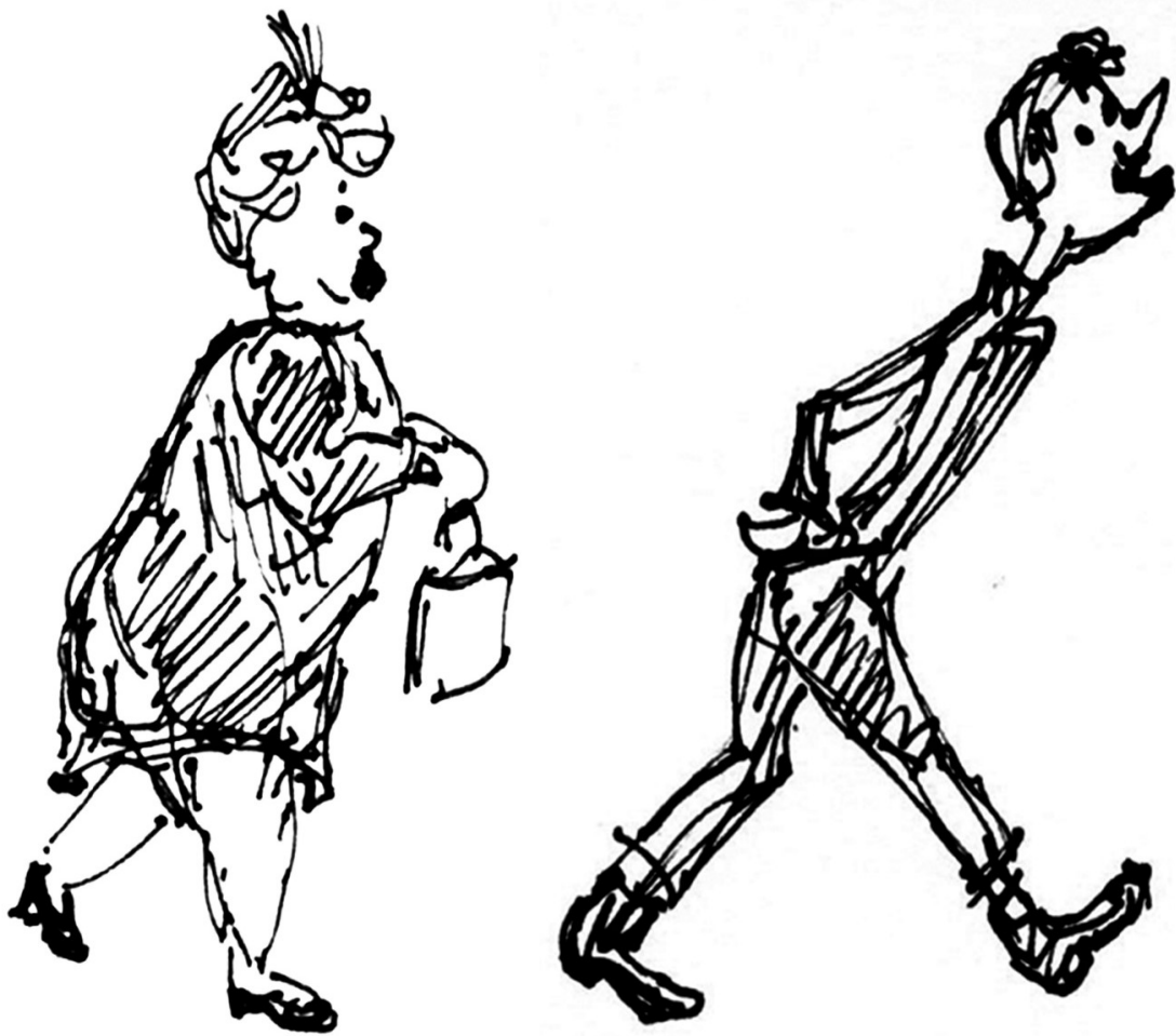
Figures 6 and 7: Chrissie Peters, (2015). Multicultural characters for New Designers.