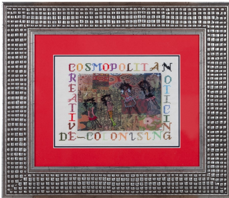
Figure 2: Beverley Hayward and Chrissie Peters, Travelling in a Cosmopolitan Milieu , (2022), embroidered collage with paper and acetate.