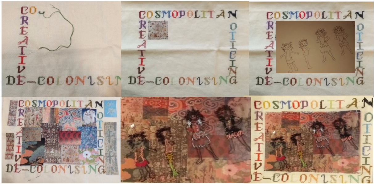
Figure 5: Beverley Hayward, (2021-22) Journal Pages: conceptualisation of ideas and preparation.