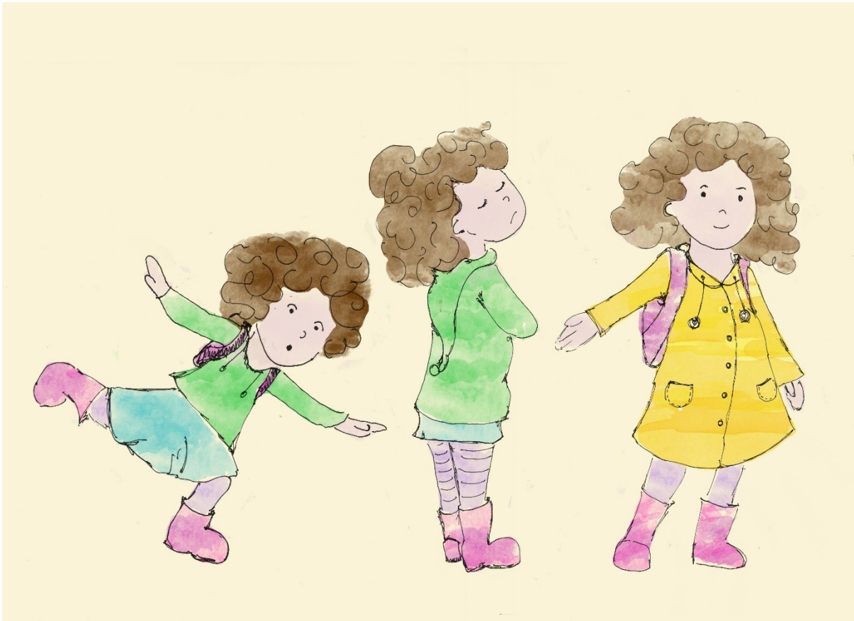
Figure 3: Chrissie Peters, (2015). Amended multicultural illustrated, character for children’s book sketch 2.