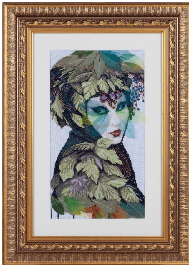
Figure 9: Beverley Hayward, Mocking the Master Narrative: The Masquerade, 2015-19, tapestry and mixed media, 30 x 40 cm, private collection.