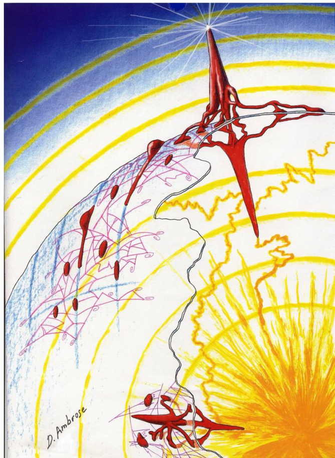
Figure 1: Example of a visual metaphor with explanation of the symbolism. From Ambrose (2021a).

Some of the theory summit scholars thought the visual metaphors were very helpful while others thought they were useless. But for me, this was a major, transformative event because it pushed me toward interdisciplinary scholarship. I love the idea of discovering concepts in diverse fields and pulling them together, and I've been doing that ever since.