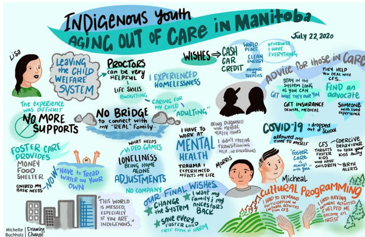
Figures 1 & 2. Graphic Drawings From Focus Groups With Indigenous Care Leavers