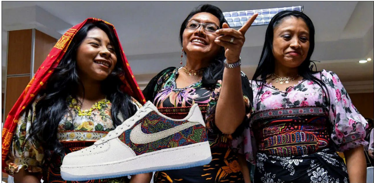
Figure 4: Campaign against Nike’s use of a Mola design 13

coloured mola design, without any reference to its producers. Critical voices were soon raised, including some of Indigenous activists in the United States, accusing Nike of plagiarism and using an Indigenous model in a decontextualised way without recognising the true creators of the design.