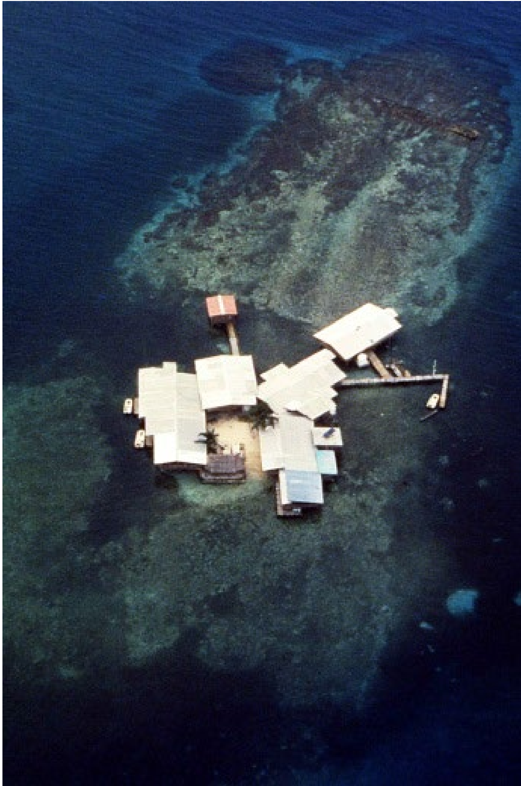
Figure 1: The former STRI station in Guna Yala 6