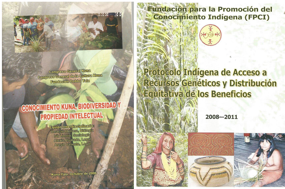
Figure 5: Covers of the documents

that recognise Indigenous sovereignty over territory and resources. The final part of the document outlines a series of factors that must be considered in any research on genetic and biological resources that is conducted in Indigenous territories. In this case, the guidelines are very general and do not indicate the Indigenous body with which access or benefit-sharing agreements should be negotiated. It merely urges researchers to respect the sociopolitical organisation of the communities, to promote participative research, and to ensure that benefits are fairly shared.