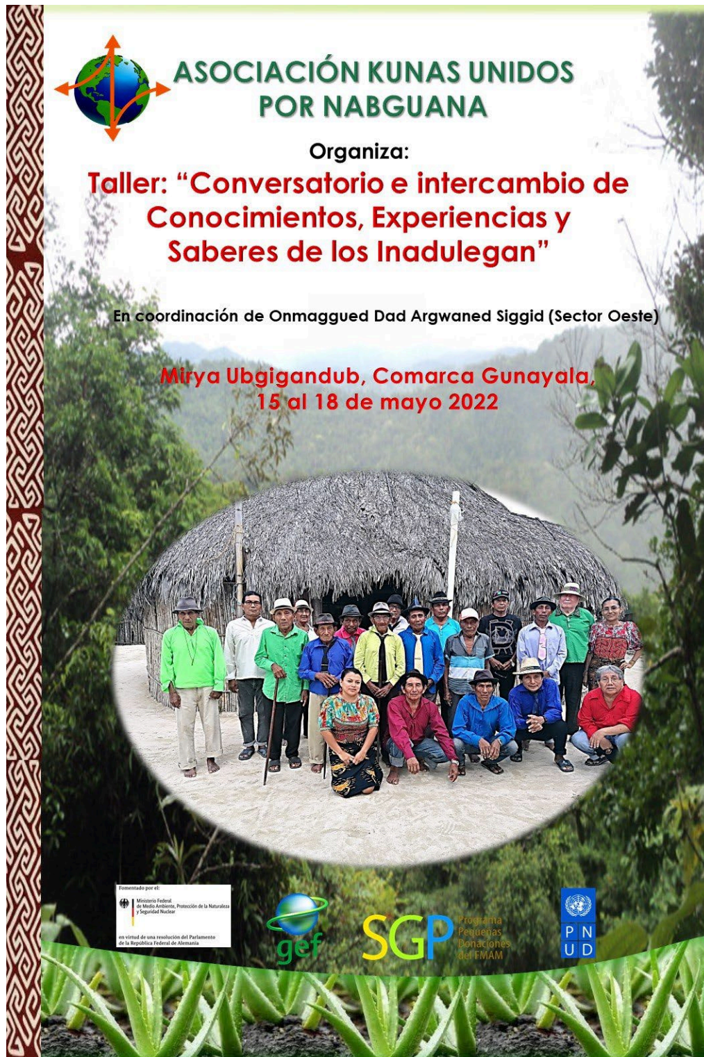
Figure 3: Poster of an Inadulegan Meeting in May 2022 11