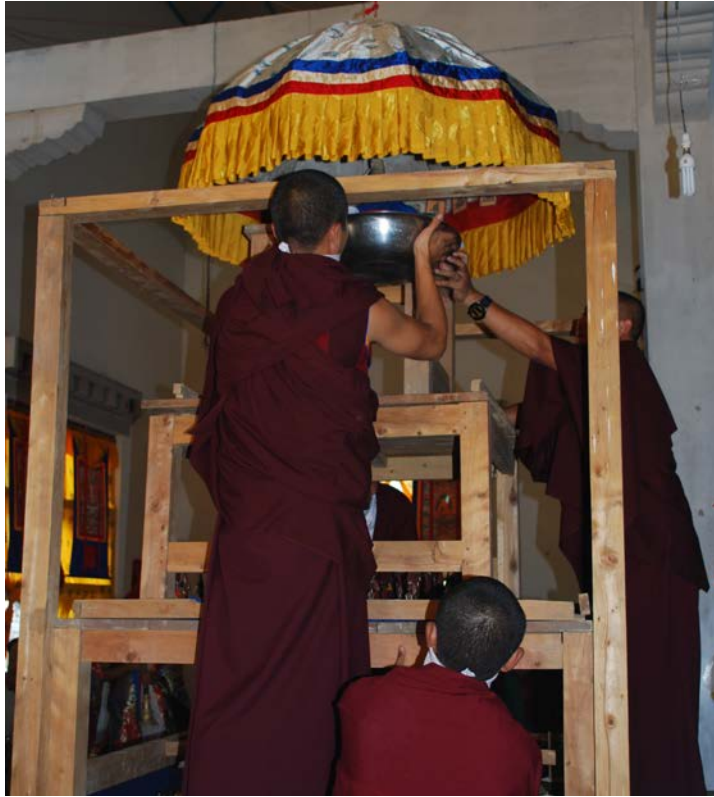
Figure 3: Placing the dish of unground medicinal ingredients at the top of the maṇḍala construction.

To sum up, sacred medicinal pill production is integrated into a full mahāyoga tantric practice connected with realising all physical, verbal and mental phenomena as enlightened body, speech as mind, led by an accomplished lama and a team of specialised meditation masters and ritualists. Special ingredients, including sacred tantric substances and substances considered to have natural medicinal potencies, are prepared and installed in a three-dimensional tantric mandala, which becomes the focus of the practice. In the first half of the ritual, a proportion of the raw ingredients are set out in a prescribed arrangement at the top of the mandala (see Figure 3), while further sacks of ingredients are placed lower within the mandala. Half-way through the practice session, on day 4 or 5 of the ritual, the now consecrated ingredients are ceremonially removed, ground up and compounded into medicinal pill pieces (see Figures 1 and 2), which are then installed within special medicinal containers, placed back into the mandala (see Figure 4) and ritually sealed. 25