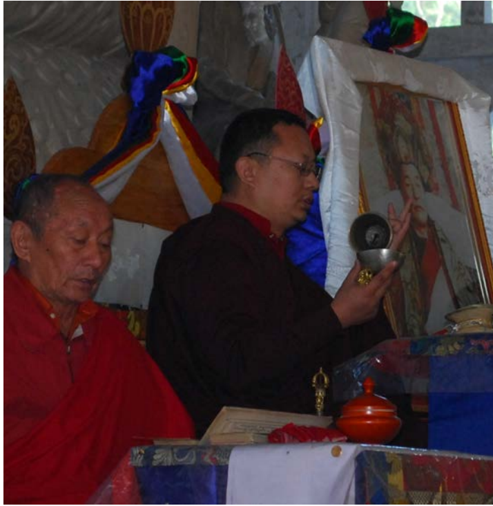
Figure 6: Medicinal Cordial offering ( smān mchod ): the Head Lama takes up a little liquid and flicks it as the offering to the tantric deities is recited.

More specifically, within the Major Practice session rituals, there are two sections where the term rasāyana may be explicitly used, and it is interesting to reflect on what might connect these two sections. My current hypothesis is that while most of the mahāyoga meditations and rituals for actualising buddha body, speech and mind within these practices have a distinctly Tibetan flavour, both the contexts in which the term, rasāyana , occurs, are picking up on specifically Indian tantric precedents. The first is during lengthy recitations for the medicinal cordial offering ( smān mchod ) (see Image 6). This offering is a standard part of all mahāyoga sādhanā liturgies, and here, the rasāyana is not the tantric pill production of the Medicinal Accomplishment rite, but the offering of liquid elixir in a skull-cup, generally of white, clear or light coloured alcoholic drink, along with consecrated medicinal pills, made to the tantric deities as one of the three elements of the inner offerings. The medicinal cordial offering, then, is made not only in elaborate rituals, but as part of the regular everyday tantric practices ( sādhanas ) of different deities, performed by individuals as well as temple communities. It has various symbolic connotations; one is that it is to be equated with the or the male wrathful deity's (Heruka's) sexual fluid, in this tantric con-