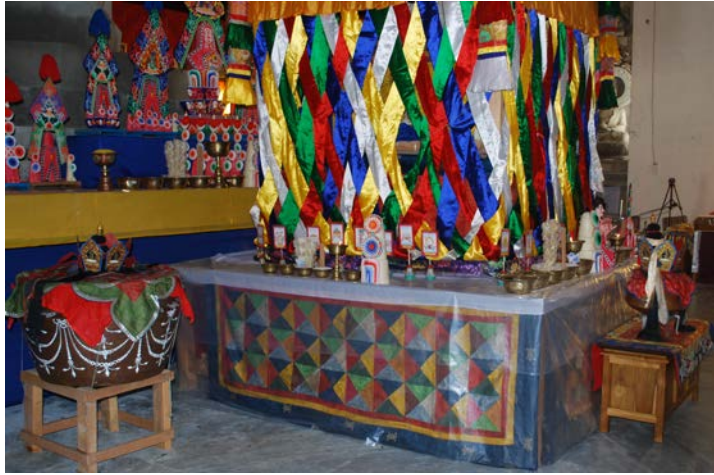
Figure 4: Maṅḍala with the large and small medicinal containers of ground and mixed ingredients, for the second half of the ritual session.

Following several further days of tantric practice, the medicinal pills become one of the key sacred substances to be ingested as siddhi substances, and distributed in the public blessings. The remaining store of pill pieces may be dried and further processed at this stage, creating a large supply for further use and distribution (see Figure 5).