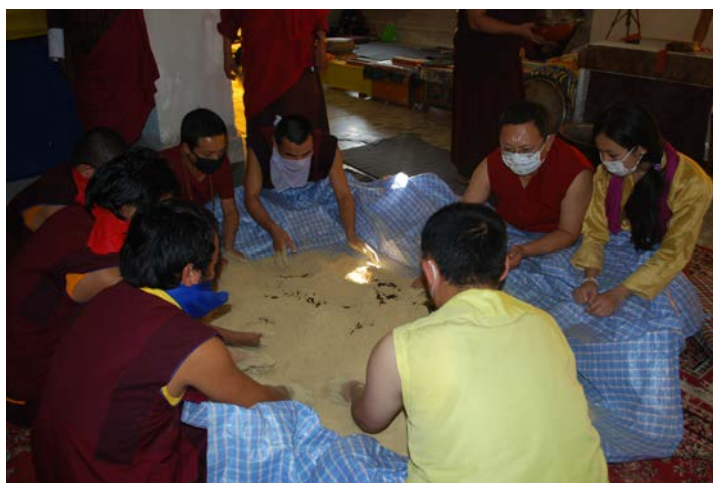
Figure 2: Mixing of the ground medicinal ingredients. Note the face masks to avoid breathing on and polluting the substances.

idiosyncratic; we see, for instance, the same characterisation in a text on Medicinal Accomplishment in the twelfth-century cycle of the Eightfold Buddha Word, Embodying the Sugatas , of Nyang-ral Nyima Özer ( nyang ral nyi ma 'od zer , 1124–1192). 24 The specific reference is in the section on the signs of success, where the quantity of collected rasāyana is said to increase greatly.