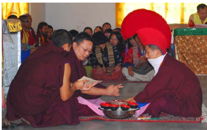
Figure 1: Ritual grinding of the medicinal ingredients at the mid-point of the ritual.