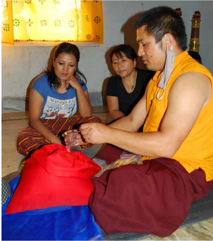
Figure 5: Putting the medicinal pills into small bags for distribution to individuals.

the generations of practitioners descending in specific lineages of tantric practice. Thus, they are known as samaya substances ( dam tshig gi rdzas ). That is, by partaking of these substances, the bonds linking the tantric community are created, embodied and repaired. And this is not only a matter of specific occasions when the pills are made. Each time, a small amount of concentrated pills will be retained by the lama for use in future batches, so that the stream or continuity of the sacred “fermenting agent” ( phab gta’ or phab rgyun ) never runs out. Indeed, The Head Lama of the Jangsa Monastery in Kalimpong told me that the late Dudjom Rinpoche used to tell his students that while there were many different specific lines through which the phab gta’ had been passed, all Nyingmapa lamas are connected since some component of everyone’s dharma pills ultimately stems back to the mass ceremonies performed in the seventeenth-century by the great lama, Terdak Lingpa ( gter bdag gling pa , 1646–1714). I have no way of assessing the accuracy of this claim, but the circulation of this story encapsulates well the notion of a spiritual bonding enacted and maintained through the consumption of rasāyana tantric pills.