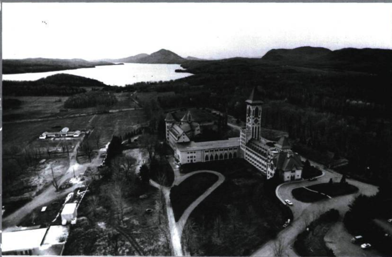
A view of the Abbey of Saint-Benoît-du-Lac.