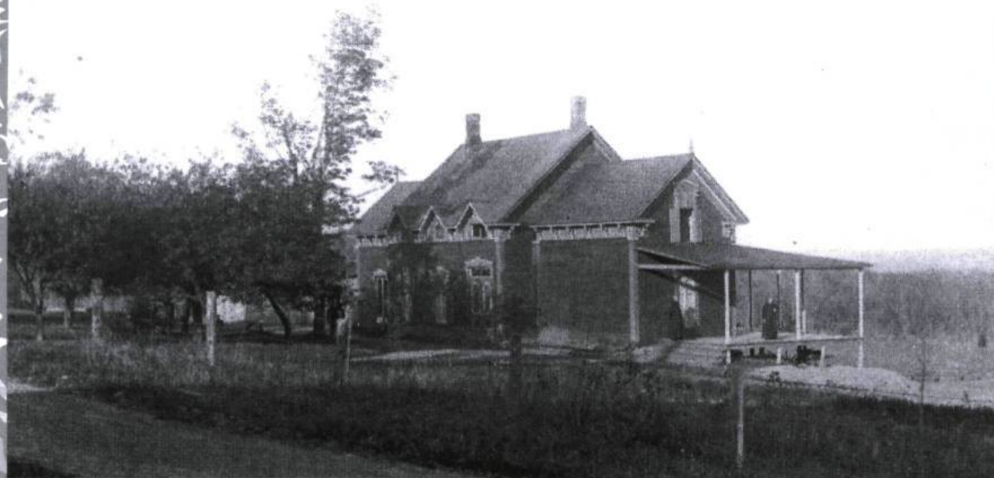
The original farm house, in 1913.