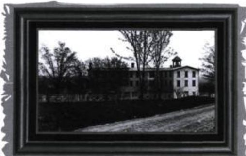
Abbey of Saint-Benoît-du-Lac, in 1935.