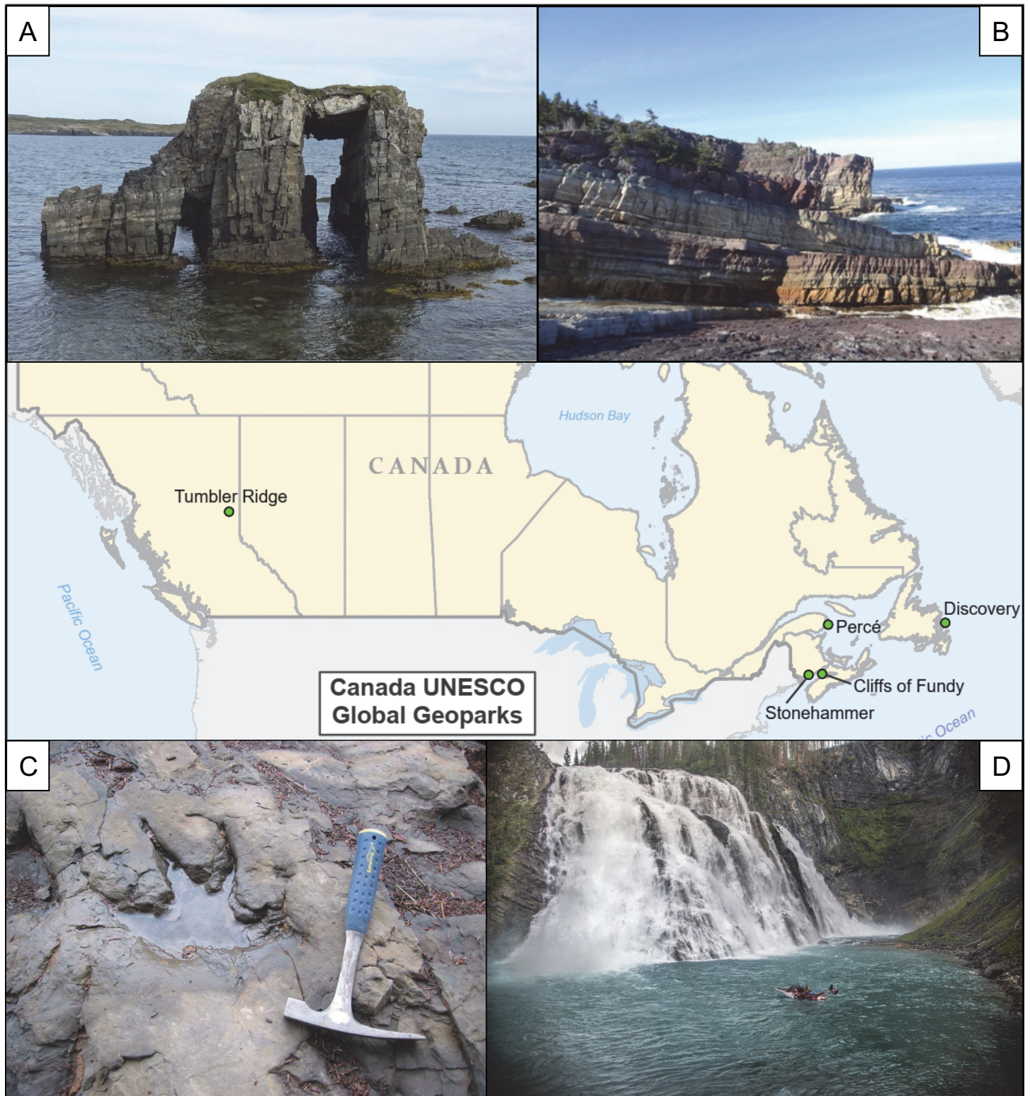
Figure 3. Map showing the location of the five Canadian UNESCO geoparks. (A) Arch Rock at Little Catalina, a triple sea arch that contains Ediacaran fossils, on the Bonavista Peninsula in Discovery UNESCO Geopark. (B) Brook Point in Discovery UNESCO Geopark, near King’s Cove on the Bonavista Peninsula (Discovery UNESCO Geopark photographs courtesy of A. Hinchey). (C) Dinosaur footprint from Tumbler Ridge UNESCO Geopark (photograph courtesy of Tumbler Ridge Museum Foundation). (D) Kinuseo Falls, Tumbler Ridge UNESCO Geopark (photograph courtesy of Tumbler Ridge Museum Foundation).