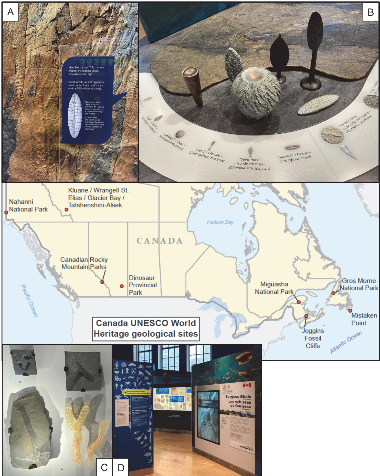
Figure 4. Map showing the location of Canadian UNESCO World Heritage geology sites. (A-B) Ediacaran fossils from Mistaken Point showing cast of a rock surface showing multiple Fractofusus specimens (A) and tactile rock surface cast and 3-D bronze models of common species (B). (C) Cambrian fossils from the Burgess Shale; Oesia fossils and 3-D model of the worm living in its tube. (D) UNESCO introductory panels. Note that Anticosti Island was inscribed onto the UNESCO World Heritage site list in September 2023 (after submission of this article), making it Canada's newest World Heritage site.