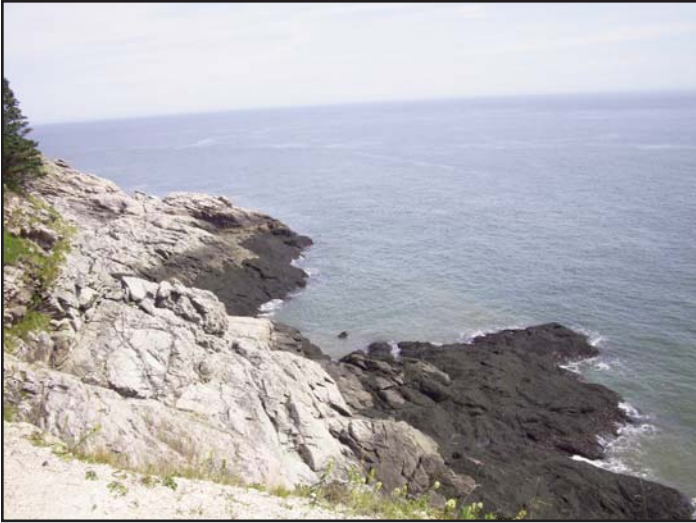
Figure 2. Cape Spencer Granite (ca. 625 Ma) of the Avalonian Caledonia terrane at Cape Spencer on the shore of the Bay of Fundy looking east along the inferred trend of the Cobequid-Chedabucto Fault.