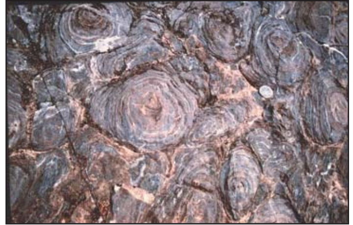
Figure 3. Outcrop of the stromatolite Archaeozoon acadense in the Green Head Group on Green Head Island.

Although some aspects of this new scenario are compelling, a number of questions remain. For example, Neoproterozoic magmatism in both the New River and Caledonia terranes occurred in two distinct pulses, one at ca. 625 Ma and one at ca. 555 Ma. Is this magmatism related? What is the significance of fossiliferous Cambrian rocks with Atlantic-type fauna in the New River and Brookville terranes? Are they part of the Saint John Group, representing the Avalonian cover sequence in the Caledonia terrane? If so, what are the implications for Ganderia versus Avalonia? Why are the Silurian arc-related volcanic rocks of the Kingston Group and adjacent high-