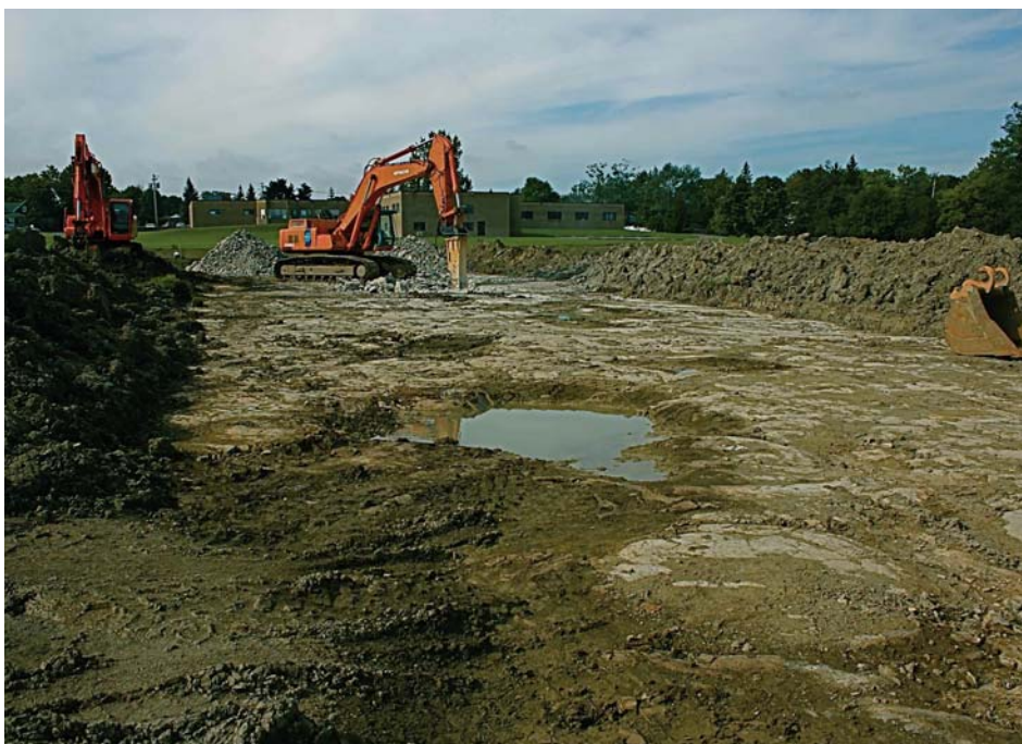
Figure 3. Overview of giant domal stromatolites in dolostone of the Oxford Formation; Ann Street Townhouse Development, Almonte, Ontario.

tax reduction and/or financial compensation for withdrawal of several townhouse lots from the planned development), there is reason to hope that a representative segment may be saved. Organizations that may offer assistance have been contacted (MMC, MVFN and Nature Conservancy of Canada); in the meantime, the ongoing operation continues to degrade the stromatolitic unit by mechanical fracturing and excavation.