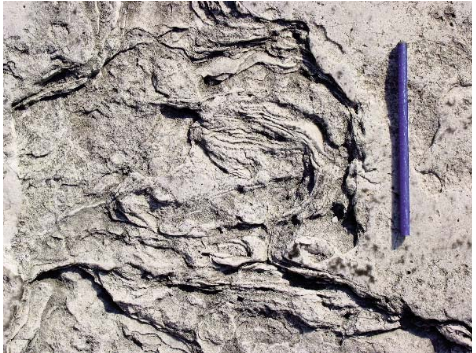
Figure 2. Biofilm structures in quartz arenite of the Nepean Formation showing a bedding-parallel view of crumpled sheets of quartz sand. These layers are inferred to have been bound by cyanobacterial mats between the sand layers, now degraded to carbonaceous wisps. The site on Highway 417 at Terry Fox Drive in Ottawa is a designated Ontario Area of Natural Scientific Interest.

As a consequence of work commenced during the summer of 2008 to add lanes to the Queensway, all outcrops within the median at the Terry Fox ANSI site will be destroyed to provide space for two new lanes. On becoming aware of this planned highway widening the author, on behalf of Friends of Canadian Geoheritage (an organization sponsored by Canadian Geoscience Education Network), contacted key officials of the Ontario Ministry of Transport, Ontario Parks and Ontario Ministry of Environment. In a meeting with these officials in 2003, a 'geosalvage operation' was deemed feasible, subject to expression of interest from museums, universities and other organizations in securing blocks for public display. Representatives of Waterloo University, Carleton University, University of Ottawa, St. Lawrence University, Canadian Museum of Civilization, and the Town of Mississippi Mills all indicated interest in receiving one large specimen each from this site. With interest thus established, approval was granted for removal of up to 10 large blocks by jackhammer and hand-operated pry bars, rather than by blasting the rock.