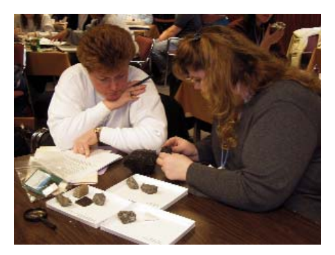
Figure 4. Teachers at a Calgary workshop discuss rocks.

The geoscientist brings to the partnership knowledge of the technical subject matter, its real-world applications and related career opportunities. Teachers, especially those of lower grade levels without specific training in science, benefit from outstanding curriculum-linked, hands-on activities and the experts' descriptions. Teachers of higher grade levels benefit from the