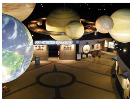
Figure 3. Reception Hall and Geo Theatre. The main Exhibits Gallery is behind the Theatre.

The presentation tells the story of the birth of the solar system through to the formation and evolution of Earth. During its showing, special effects in the theatre, including sound, light and music, dramatize