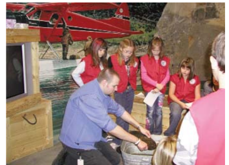
Figure 9. Panning for gold at a 'mineral exploration camp'.

Public Lectures are a free and regular feature at the GEO CENTRE, and those presented to commemorate the International Year of Planet Earth (IYPE) have been especially well attended (speakers have come from the St. John's geoscience community, the Geological Survey of Canada, and even internationally, e.g. Dr. Robert Ballard, scientist emeritus, Woods Hole Oceanographic Institute). The general public and students are also invited to a series of Special Events hosted by GEO throughout the year. These include Earth Day celebrations (featuring, for example, 'Stump a Geologist', 'Panning for Gold' (Fig. 9), and solar observations guided by members of the St. John's chapter of the Royal Astronomical Society of Canada); a bridge-building competition sponsored by National Engineering and Geoscience Week; and 'Doors Open St. John's', an event during which the GEO CENTRE and other museums and institutions in the city offer a free exploration of exhibits and facilities. Finally, GEO renews interest in its mission and complements its permanent galleries by hosting Travelling Exhibits , mostly during the off season. These are displayed in the Celestial Gallery, new space developed at the entry level and leading off the main entrance. Some of these temporary exhibits have enjoyed corporate sponsorship and helped generate valuable media interest. Exhibits hosted to date include: Dinosaurs and Company, From Crystals to Gems, and Arctic Adventure.