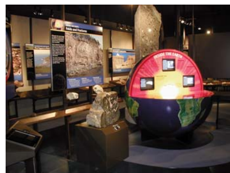
Figure 4. Dynamic Earth explained in Our Planet exhibit.

The pre-eminence of the sun and its influence on our planet are acknowledged; the rock and water cycles highlighted; weathering and weathering products shown; and mountain uplift depicted to continue the theme of Earth's dynamism (Fig. 4). Explaining the Earth's internal heat