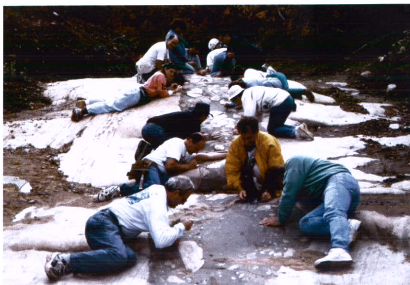
Figure 2 Papineau-Labelle Wildlife Reserve, Quebec: EdGEO fieldtrips provide teachers with a close-up look at local geology and instill in them an excitement and interest to share with their students.