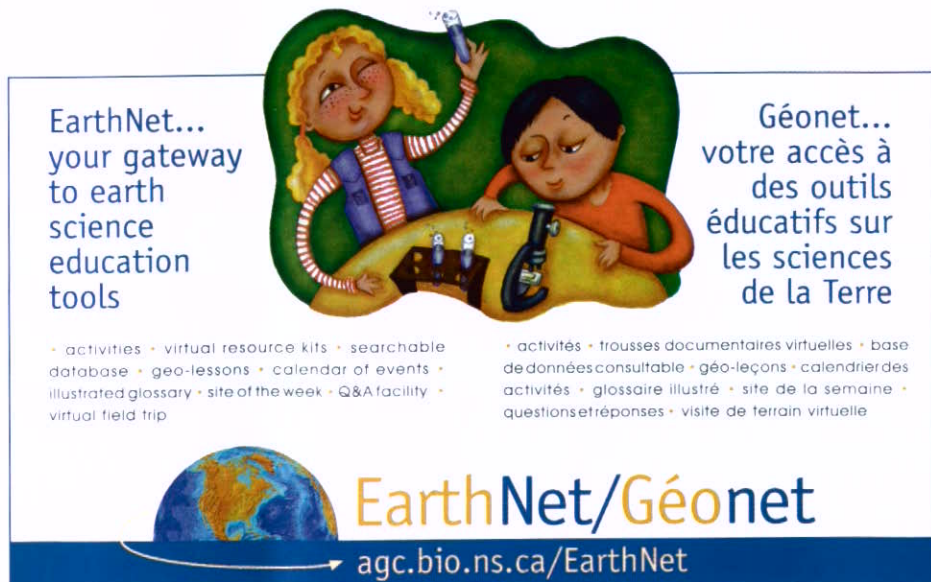
Figure 3 EarthNet, gateway to geoscience education resources.

The Geoscape Canada program, led by the Geological Survey of Canada in partnership with provincial and municipal agencies and educators, communicates practical earth science information to communities across Canada. The program operates on the premise that if we want to show Canadians the usefulness of earth science information, we must explain local geoscience issues that are relevant to them. Canadians want good water supplies, continued access to earth