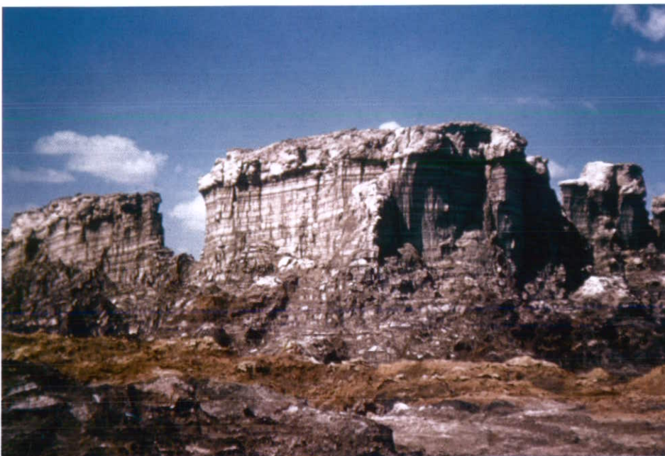
Figure 1 Bedded halite capped by bed of less soluble gypsum, forming "pillars" due to erosional dissolution, Danakil area, Eritrea (from Holwerda and Hutchinson, 1968).

misbehaved and turned into a pillar of salt, presumably like those in Eritrea (Fig. 1). Copper, readily identified from its colours in oxidized outcrops, was smelted as early as 5000 B.C., at a thoroughly studied archeological site at Timna in the Israel Negev near Eilat (Poss, 1975, plate 48) where copper has also been mined during recent decades. Copper was combined with tin, won and smelted from placer cassiterite, to make the vessels and tools of the Bronze Age throughout the near- and mid-eastern world in the 4th and 3rd pre-Christian millennia, but the geographic source of this abundant tin remains uncertain and conjectural, one of archeology's unsolved enigmas (Raymond, 1984, p. 33). Gold, then as now the most highly prized of all, and probably the first found, initially went almost exclusively to the powerful and affluent to signify wealth and power, and for decorative and religious purposes. Gold's use in coinage developed somewhat later, about 700 B.C., in Lydia. It was widely won from placers and lodes. The ancient Greek legend of Jason and the Golden Fleece is almost certainly an allegorical account of a gold prospecting expedition to the eastern Black Sea coast, where fine gold was apparently won by washing auriferous stream sediment through lamb's fleece (Bernstein, 2000, p. 15-16, 30).