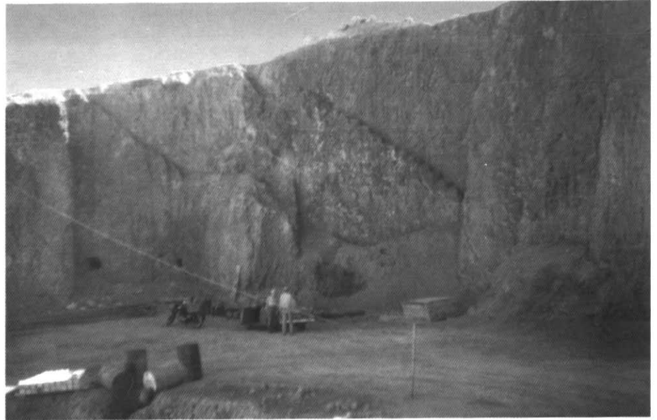
Figure 5 Old downward-accessing Roman stairway exposed in wall of modern pit, near Troulli, southeastern Cyprus.

none, only a worthless and unrecognized new element, nickel! Similar silver-rich veins were soon discovered at Konigsberg in Norway. Then, much later but dearer to Canadian hearts, also in 1899 in northern Ontario, prompting that first great claim-staking “rush” that truly initiated Canada’s mining industry, and