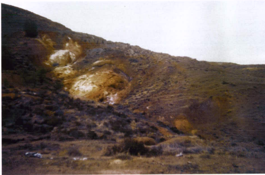
Figure 3 Gossan above mined-out Mavrovouni orebody showing “live, hematitic-limonitic colours,” near Skouriotissa, Cyprus.