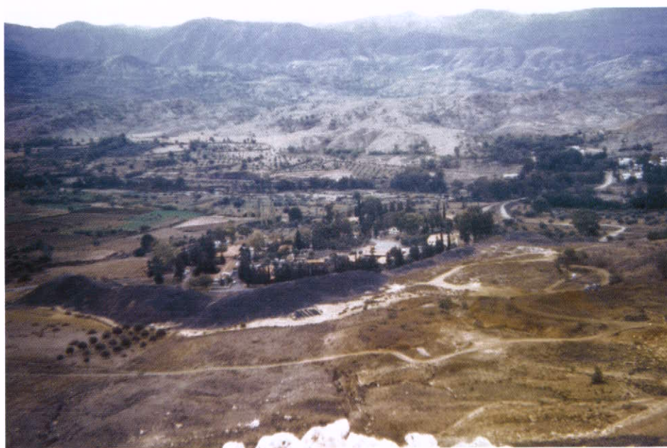
Figure 4 Ancient Phoenician (reddish and right, below centre) and younger Roman (black and left, below centre) slags at Skouriotissa in Cyprus.