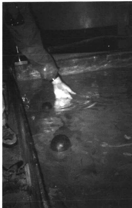
Figure 6 Steel balls floating in tank of native mercury, Almaden, Spain.