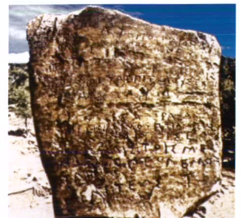
Figure 2 Slab from Ancient Laurium describing a mortgage of a mining property at Laurium. Acropolis Trustee, Museum of Ancient Agora, Athens, Greece.

Silver, won from cupellation of argentiferous galena at Laurium, south of Athens, where archeological evidence shows that mining began about 3500-3000 B.C., funded the Athenian fleet's victory over the Persian flotilla at Salamis in 480 B.C. (Kakavoyannis, 1988, p. 44-45; Raymond, 1984). The oldest known mining documents, also from Laurium, are marble slab inscriptions. One (Fig. 2), now in charge of the Acropolis Trustee, Museum of the Ancient Agora in Athens, concerns a mortgage on a mining property. Romans prospected and explored from Anatolia in the east to Cornwall in the northwest using many time-honoured methods such as surface stripping, pitting, trenching, and "divining," as well as currently used indicators. They are known to have "grubstaked" local prospectors who were sent to seek out mineralized outcroppings and auriferous placers. Gossan prospecting is not new! Gossans or "eisen huts" in later European terminology, were indicators not only to Romans but to their predecessor Egyptian and Phoenician explorers. This "live" gossan (Fig. 3) remains visible on outcrops above the now mined out, 20 million tons of ca. 4.0% Cu ore body at Mavrovouni in Cyprus. It must surely have attracted the attention of earliest prospectors, perhaps leading to the copper mining which, according to archeological evidence, had begun by