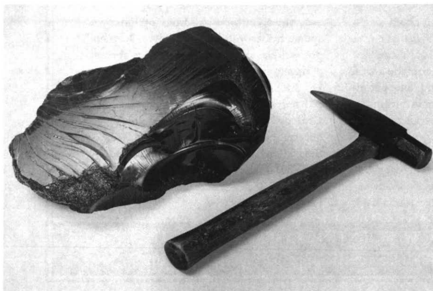
Figure 3 Specimen of Albertite, NBME 1113 (hammer handle 30 cm long).

Very little information about the activities of Foulis is available, but ongoing research may resolve some of the questions regarding his claim concerning his early use of