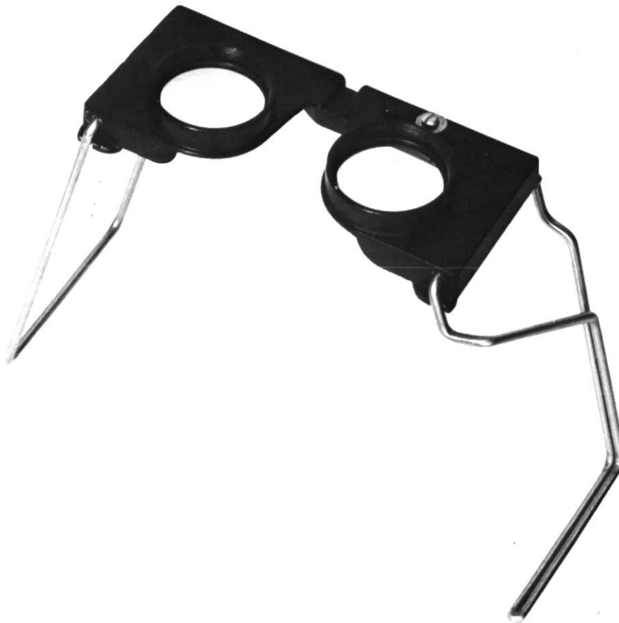
Figure 2 Pocket stereoscope with cut-away leg.

referring to the use of single photographs, and also that he did not study photographs stereoscopically as a matter of routine. Stereopairs of aerial photographs usually produce exaggerated relief (Matthes, 1928), and because of this, it is not true that an observer with normal stereoscopic vision can see as much from the aeroplane as he can on the corresponding stereopair of photographs.