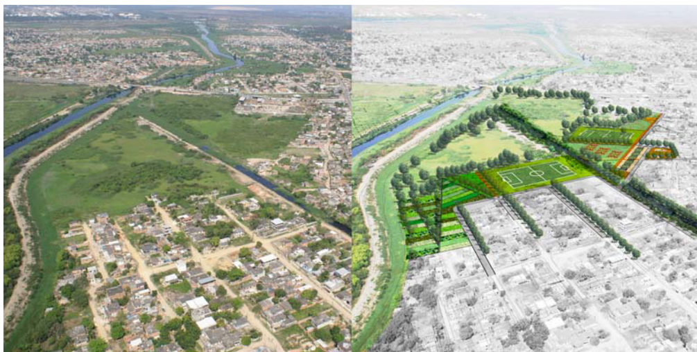
Fig.2 – Opportunities of intervention. Remaining open spaces along the rivers. Sarapuí River