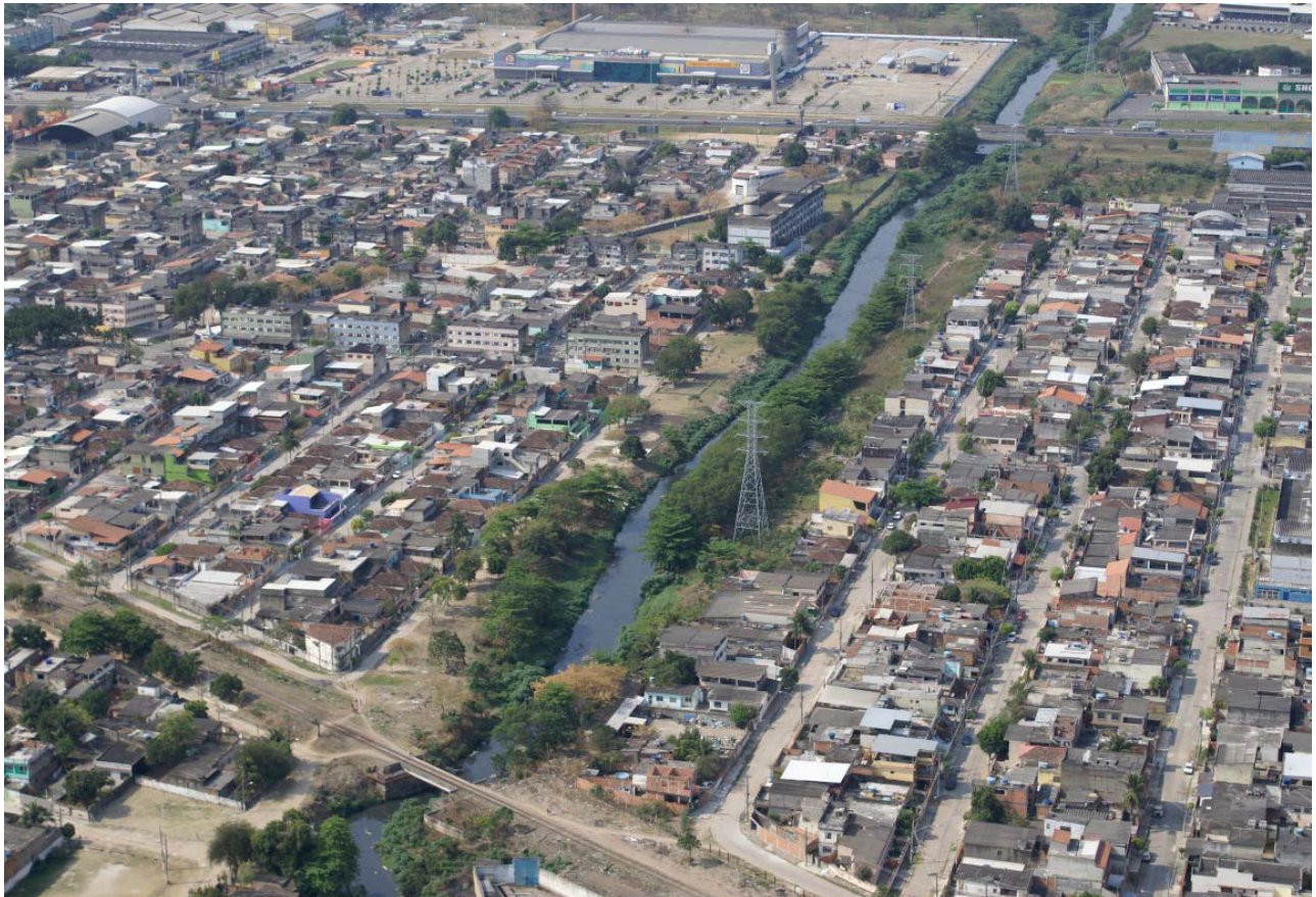
Photo 2 – Botas River, Belford Roxo, before intervention. Panoramic view