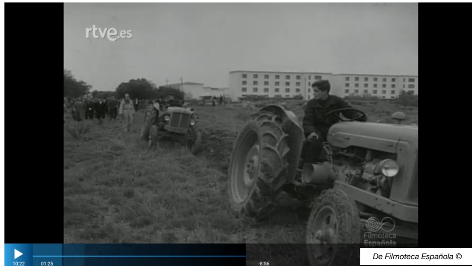
Image 2: Students from the Francisco Franco Labor University in Tarragona in a tractor driver training course.