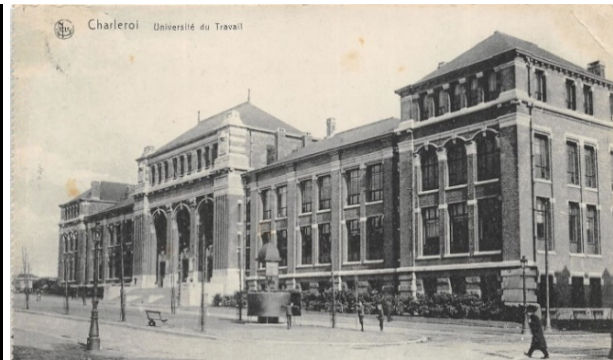
Image 3: Model of the José Antonio Primo de Rivera Labor University (Seville) and main facade of the Belgian UT.