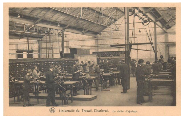
Image 4: Students in workshops (Francisco Franco Labor University in Tarragona and UT).

The voice-over of the Noticiario n. ° 567A (16/11/1953) explained that the Labor University of Zamora 5 had a capacity for more than 600 external and 300 boarding children and had “workshops for carpentry, printing, tailoring, shoemaking, forging and mechanics with modern machinery”. In Noticiario n. ° 695A (30/04/1956) the presenter reported that the José Antonio Primo de Rivera Labor University (Seville) covered a total of 1,078 square meters, was shaped like a fishbone and had a capacity of 6,000 students, although only 500 young people were enrolled in its first year (Documental en Blanco y Negro, Resumen de la Actualidad Española [Summary of Spanish News], 1956, 01/01/1957). The Onésimo Redondo Labor University in Córdoba occupied an area of four million square meters, comprised of six buildings in a cross and each building was a school (Noticiario n. ° 724A, 19/11/1959) (see Image 5). During its first