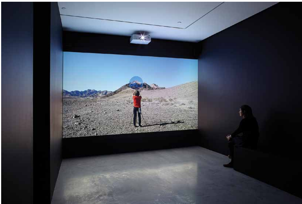
Richard T. Walker, Outside of All Things . Exhibition view at Carroll / Fletcher contemporary art.