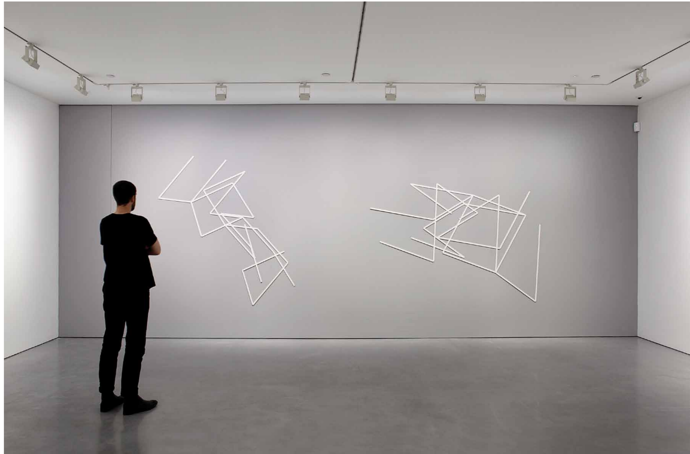
Manfred Mohr, One and Zero . Exhibition view at Carroll / Fletcher contemporary art.

No, I don't like labels, and "new media" specifically leads people to make assumptions based on preconceived ideas about the nature of this work, and can often dissuade some people from even looking at it. This is nonsense. When you talk about painting, sculpture or photography, these generally are clearly defined terms but when you say "new media" then to me it becomes meaningless and indefinable... I'm bound to ask: where do you draw the line? I tell my artists: "don't call yourself a new media artist, you're simply an artist." Perhaps a decade ago artists thought this was necessary, that it had value. But I don't agree: great works of art can hold their own irrespective of the format or medium. Fortunately, newer generations of artists are much more aware of narrow categorizations;