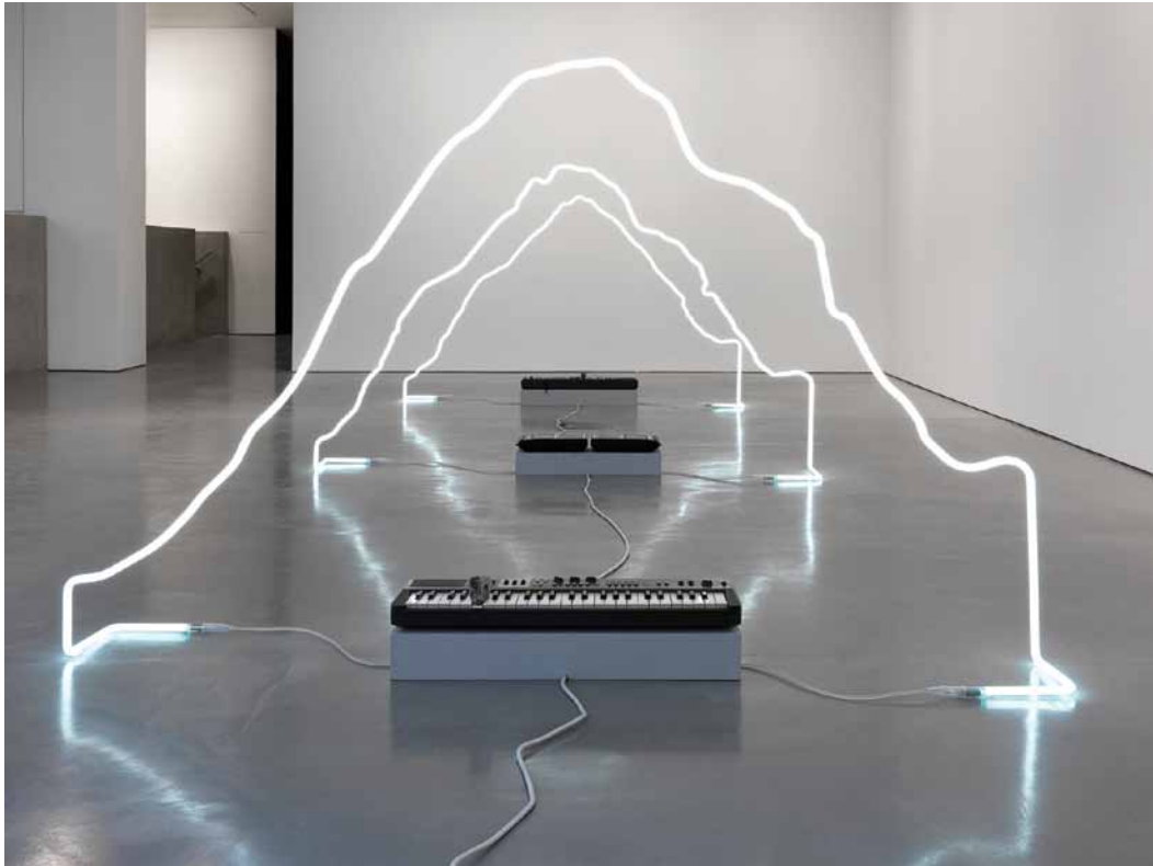
Richard T. Walker, In Defiance of Being Here . Exhibition view at Carroll / Fletcher contemporary art.