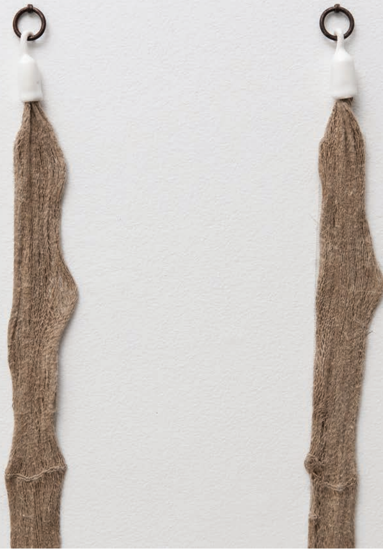
Beth Stuart, Stanchions for E.H./Immanent collapse , 2012, spranged linen, porcelain, iron hooks, gesso, acrylic paint, image courtesy the artist, photography: Paul Litherland.

dictate where they are placed and how they relate to each other – and how we relate to them. Stuart is a seeker of liminal states, which have multi-tiered suggestions for the reading of her work.