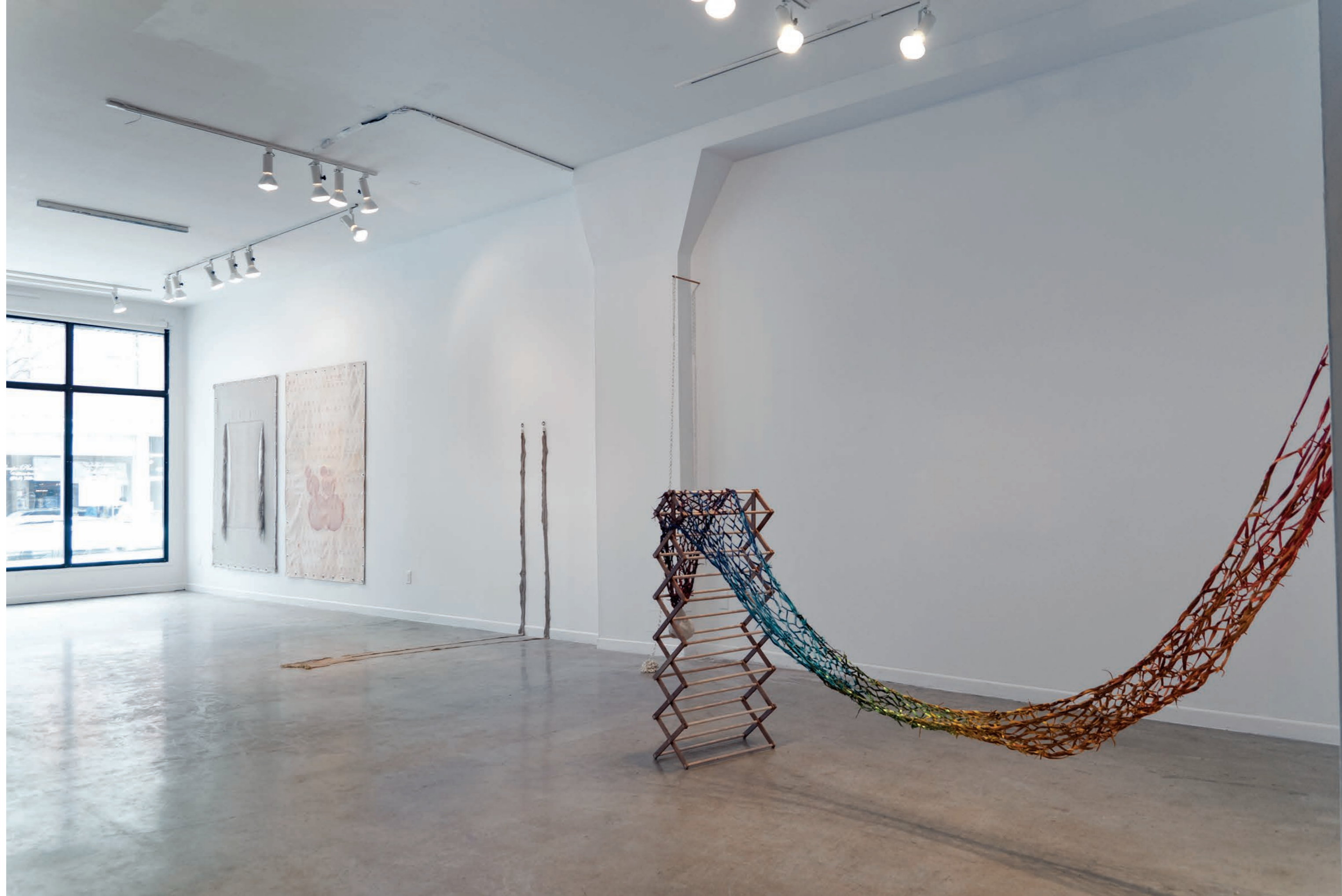
Beth Stuart, Installation view, What Bonds Are These? , La Centrale Galerie Powerhouse, image courtesy the artist, photography: Paul Litherland.