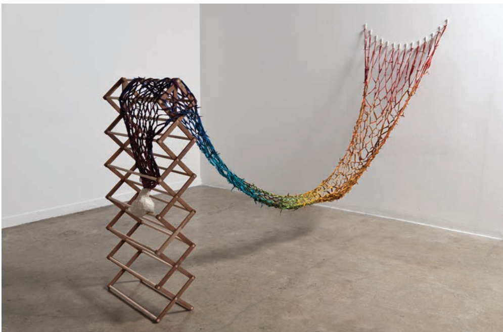
Beth Stuart, Stanchions for E.H./Thingdu , 2012. Spranged handcut leather, maple, walnut, unique porcelain vessel, unique glazed porcelain hooks.