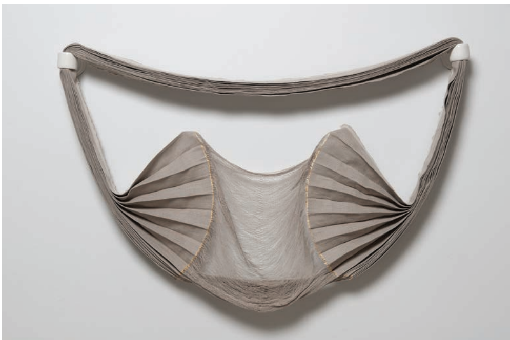
Beth Stuart, But a weak smile , 2012. Commercial artist's linen (weft partially removed, warp spranged, remainder pleated), gesso, gold leaf, unique glazed porcelain stanchion hardware, image courtesy the artist, photography: Paul Litherland.