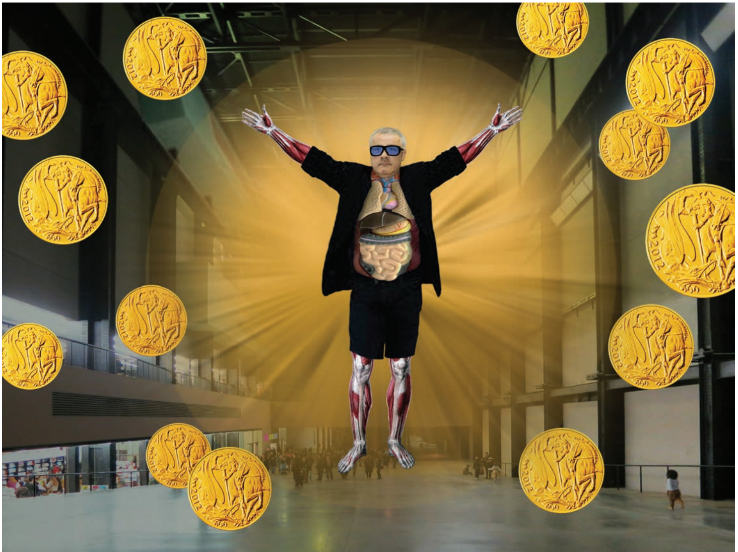
Damien Hirst, All Hail . Tate Modern Turbine Hall.