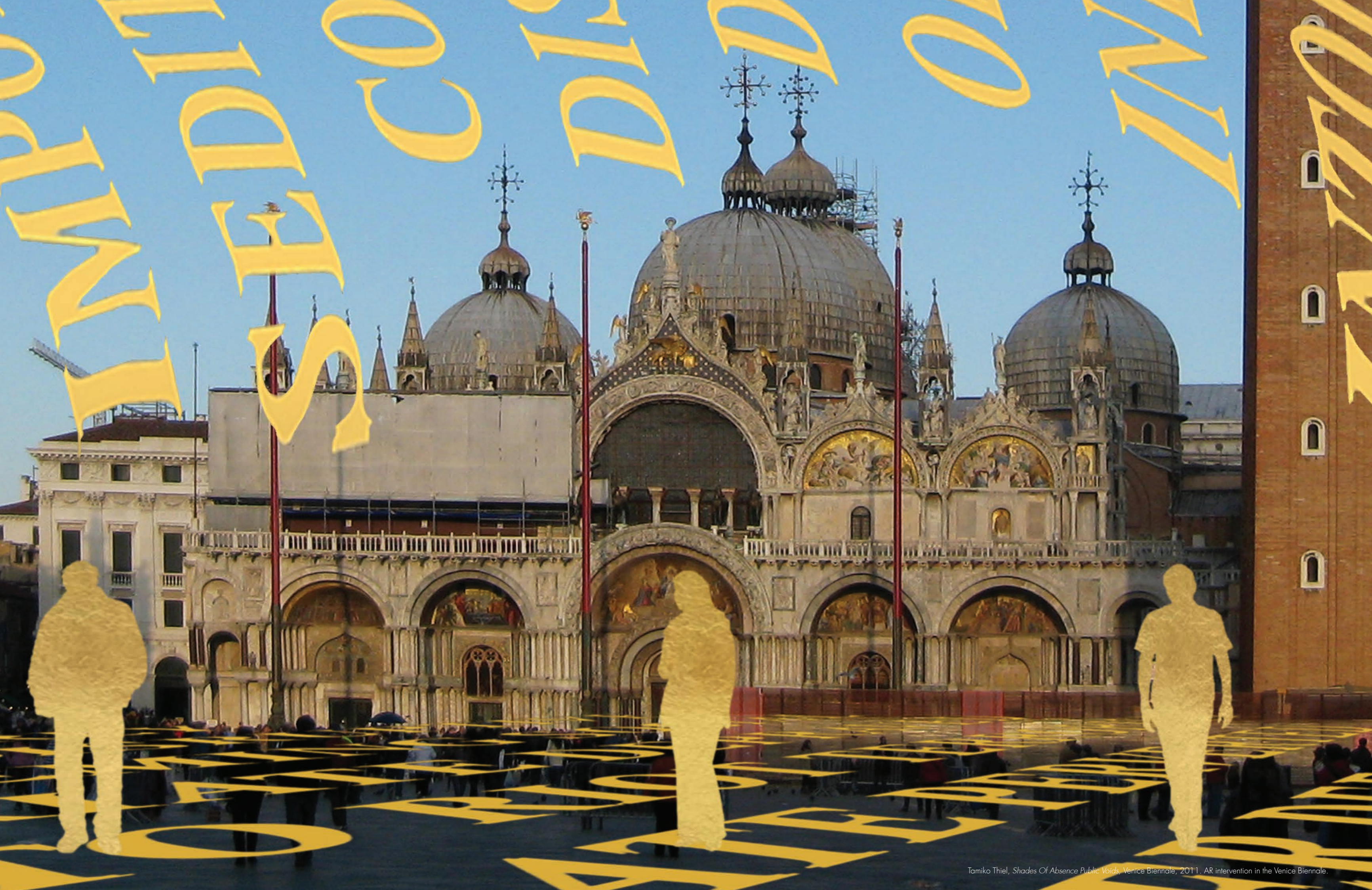
Tamiko Thiel, Shades Of Absence Public Voids , Venice Biennale, 2011. AR intervention in the Venice Biennale.