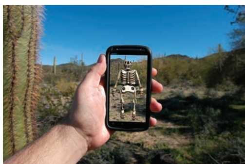
John Craig Freeman. Border Memorial : Frontera de los muertos , 2012. Augmented reality public art, Arizona, USA.

mobile devices. The white cube is thus virtually “invaded,” as artists (and the public) are now able to “write” on the walls of the museum, a twist that reminds us of the changes web 2.0 technologies brought to the previously static World Wide Web. It is tempting to state that AR interventions are redefining the gallery space, but that would take us to the utopian vision of the early net artists, who proclaimed “to be bypassing art institutions” 10 and conceiving of the Internet as a temporary autonomous zone, in which individuals would be on the same level as institutions and the roles of the main actors in the art world would disintegrate and mutate. Net art did not disintegrate the hierarchies of the art world, but rather has been (partly) assimilated by them. AR art may follow the same path, precisely to the extent in which its manifestations tend to support the concept of a white cube where “things become art.” The white cube, in this way, is