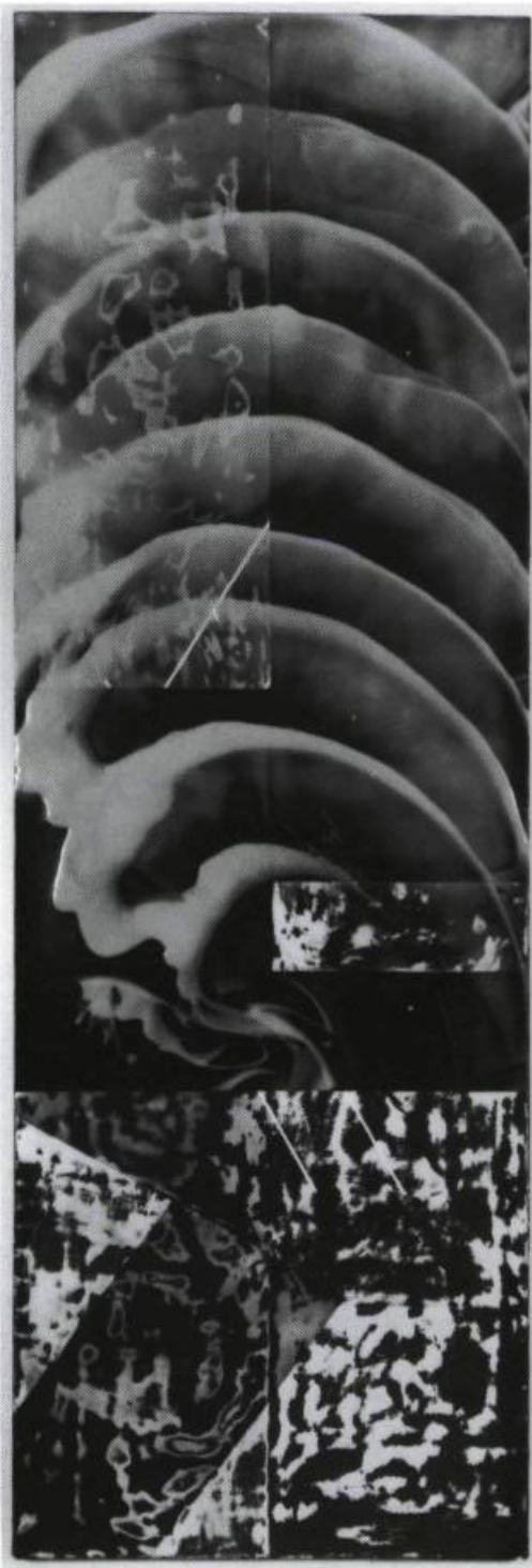
David Reed, No 202-2 , 1982-86.

D.R. : Yes. As a student and after, I was completely happy struggling with painting. It challenged me in every way : physically, intellectually and emotionally. Perhaps more than most I tend to separate emotion and intellect; painting seemed a way of combining them. I