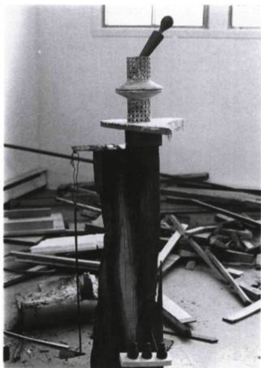
Serge Murphy, Sans titre (environment component), 1988. Mixed media; 110 x 40 x 30 cm. (sight).

treatment technique (lamellage) Sauvé floated a cross-section model of a mutant seed (its plumule inverted so that growth was turned back into the embryonic centre) on wooden stylized gusting wind and tossing wave. In the companion piece a debris-scattered sheet of water swept over a bundle of saplings brought to ground. Cellular miscombination or environmental mismatch signaled eminent early demise.