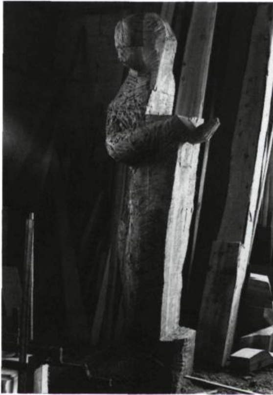
David Moore, work in progress, 1988. Wood; 210 cm. h. (sight).

biases) crafts and indeed a more tenable view of popular "culture" are among manifestations of our current fine art milieu, they are but shoots tangled in the thicket of a postmodern growth. To perceive the "raison d'être" of the Histoires de bois project in largely recuperative (historicist) or parochial (stylistic) terms would be to deny the necessity of complementary diachronic and synchronic perspectives.