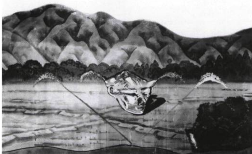
Julian Schnabel. Eulalio Epiclantos After Seeing St. Jean Vianney on the Plains of the Cure d' Ars , 1986. Oil and tempera on muslin; 135 x 173 in. Private Collection

ings are portraits of women rendered in a chic, magazine-style illustration. Despite the presence of broken plates these pictures possess the one quality that Schnabel's earlier plate paintings were stridently devoid of: tastefulness. They have none of the surging ugliness, the impassioned recklessness of the work from the early 1980's. They look, in fact, like well executed imitations of early Schnabel that have missed the whole point.