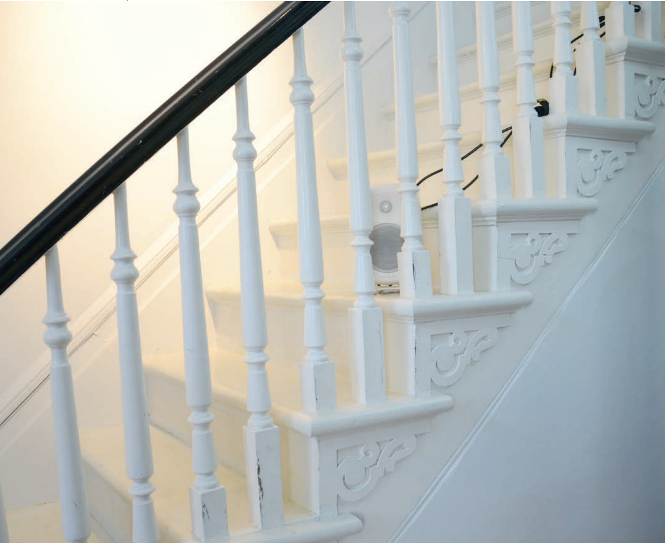
Lewis Kaye, Nanocuratorial event, Flevoland, Montréal, 2012.

What is an audio archive? At first glance, this seems like a straightforward question. Our minds turn to collections of recorded sounds of historical or documentary relevance, perhaps tapes or vinyl records, kept and managed by libraries and used for historical research. This traditional notion of the archive still informs much of the thinking behind how audio archives are constituted, maintained, and used. Notions of heritage and cultural preservation are often the rationale that underpins the existence and operational philosophy of many contemporary sound archives. Of pressing concern for such archives today is how to preserve and make available the analogue recordings of the past given a rapidly changing digital and networked technological environment. A second, related issue is the preservation of the actual analogue technologies themselves, as this is what facilitates access to the recorded media.