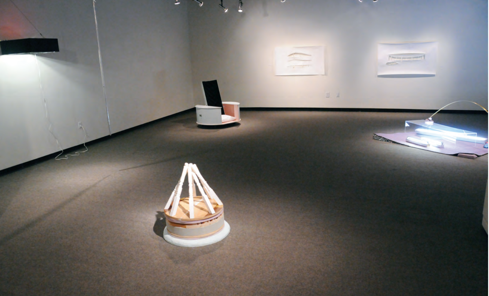
Andrea CARVALHO, Installation view , 2012. The Latcham Gallery.