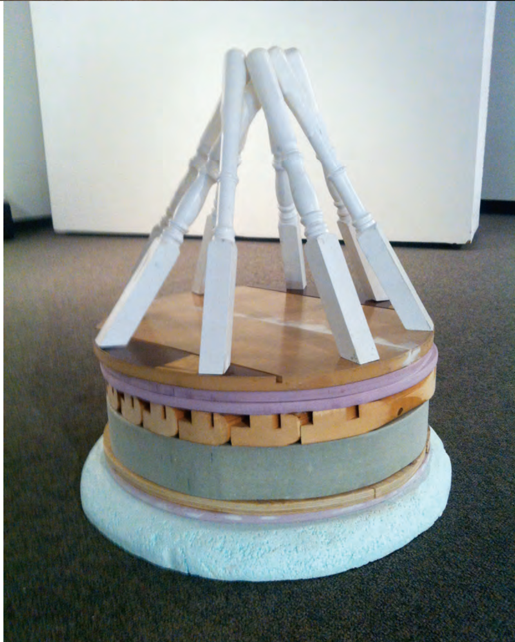
Andrea CARVALHO, Engineering , 2010. Plaster, wood, styrofoam. 71 x 50,8 cm.