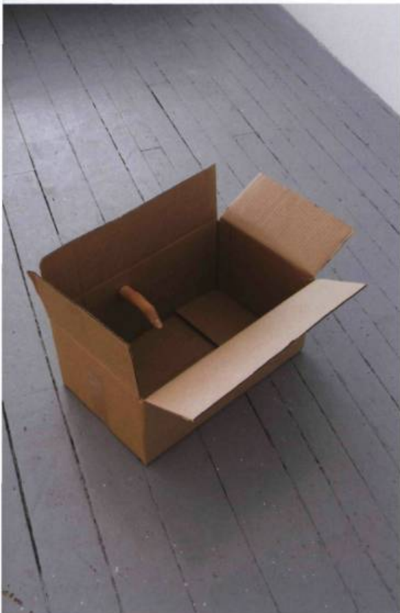
David ARMSTRONG SIX, Your Sadness Equals My Sadness And So On , 2008. Carved wood, cardboard box. 11 x 22 16 inches.

A blackboard drawing of a healthy child goose-stepping obediently suggests another grim aspect of the country's history. In the drawer lies a partially embroidered swastika. A child's lower torso and a woman stretched into agonized elongation are created from barbed wire. Two pysanky are positioned at a child-sized table where the artist, as a little girl, might have played quietly while hearing the silence and tension endured by adults around her, those who brought these histories and terrible memories to Canada. But these eggs are not coloured in the symbols representative of their culture, they are black with white