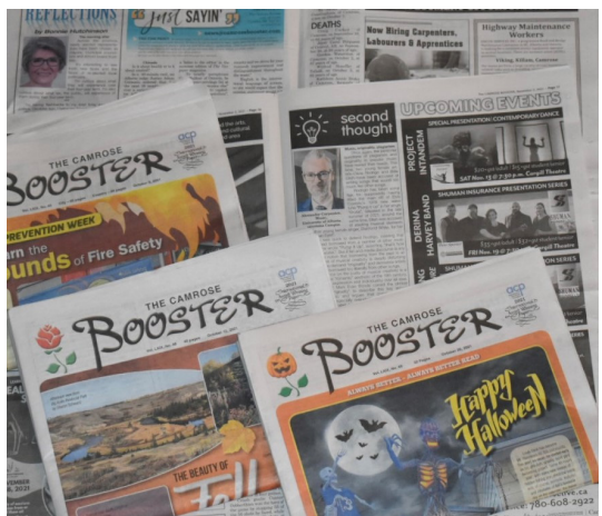
Copies of The Camrose Booster, a local newspaper in Camrose, Alberta.