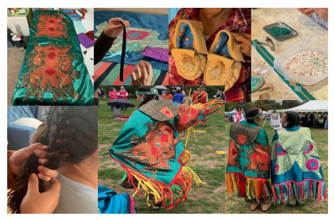
Figure 1. The works of preparing and participating in the pow wow dance.

In my life, lived Indigenous scholarship unfolds from my Anishinaabe culture steeped in ancestral knowledge and oral traditions. This is where kinship systems and community build leaders, pass on knowledge, and provide a lived educational arena for our people. In publications, we begin with a blank page and build from there, drawing on our peers and scholarly communities' genealogies of knowledge. In these moments, the material is my blank page; the story is in the applique; the knowledge mobilization occurs in passing on teachings, sharing knowledge throughout the process, and at the pow wow through dance and enacting centuries of oral traditions. My Indigenous scholarship began with a vision of regalia and shawls, and like a manuscript, it took months to create. I have included a photographic compilation of how living Indigenous knowledge comes from within and moves into kinship and community.