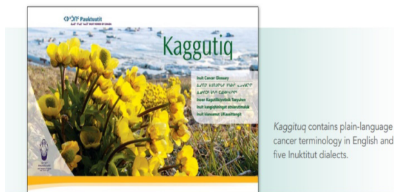
Figure 2. Inuktitut-language cancer glossary

We also knew that working together as partners would be an effective way to combine our experience and expertise. Together, we found funding to begin phase two of the project that included the dissemination of the glossary and the development of new tools and resources to support patients, cancer survivors, family members, and healthcare providers.