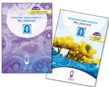
Figure 3. My Journey patient resource

Pauktuutit, CCS, and the project advisory committee are currently collaborating on the second phase of the Inuit Cancer Project. During the first four years, Jaguar Land Rover Canada provided funding, with the fifth and final year of the project funded by CCS. This phase focusses on developing and providing accurate information and culturally appropriate resources to support recently diagnosed Inuit through their cancer journey and improving communication among Inuit, their medical interpreters, and healthcare providers. The patient resource Inuusinni Aqqusaqtara – My Journey has been successfully launched throughout the regions of Inuit Nunangat, with enhanced outreach and dissemination to the cancer healthcare community