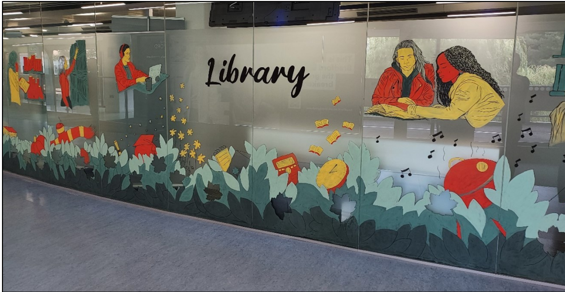
Figure 2 Library mural.