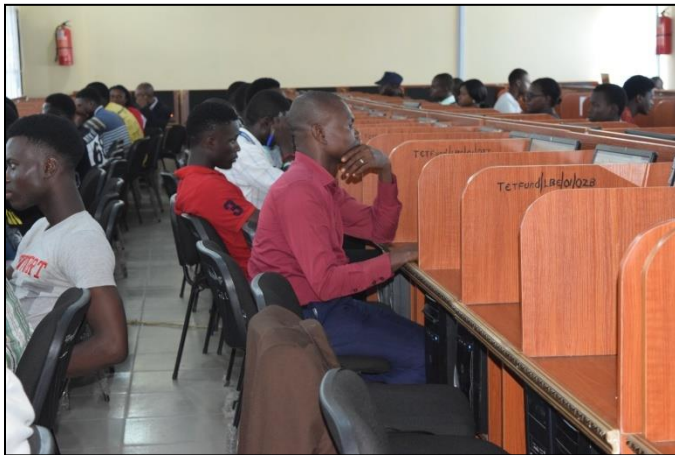
Figure 4 Students browsing the Internet at the FUPRE e-library.