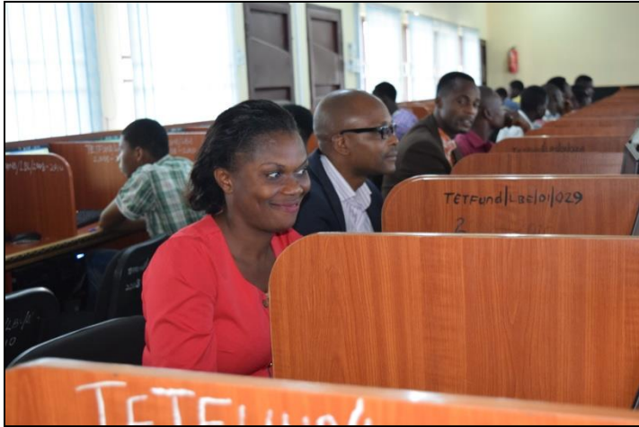
Figure 3 Staff and students accessing the Internet at the FUPRE e-library.