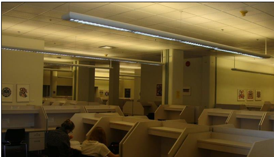
Figure 5 Participant's photo of a dark corner of UVic McPherson Library.

Yet there were also many photos of areas in the library that are dark and ominous (see Figure 5).