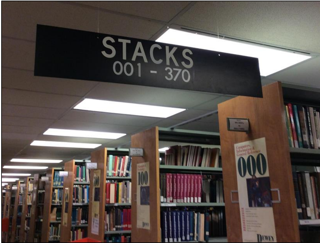
Figure 2 Participant 7's photo showing a sign for the stacks at the OISE Library.

participant explained that the combination of natural light and electrical outlets made this place “prime real estate.” The photo also led to a long discussion about the use of library spaces for events, the importance of quiet study spaces, and the sense of ownership students feel for their favourite library places. I hope the second phase of analysis will reveal more examples like this and open the door to potential new research questions regarding the student culture in library spaces.