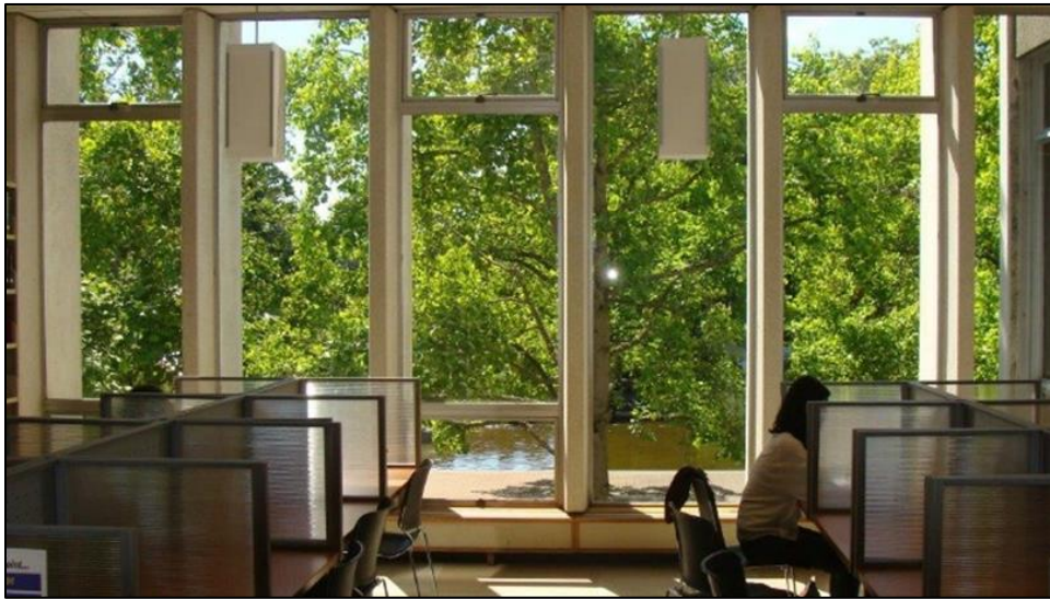
Figure 4 Participant's photo of natural light at UVic McPherson Library.