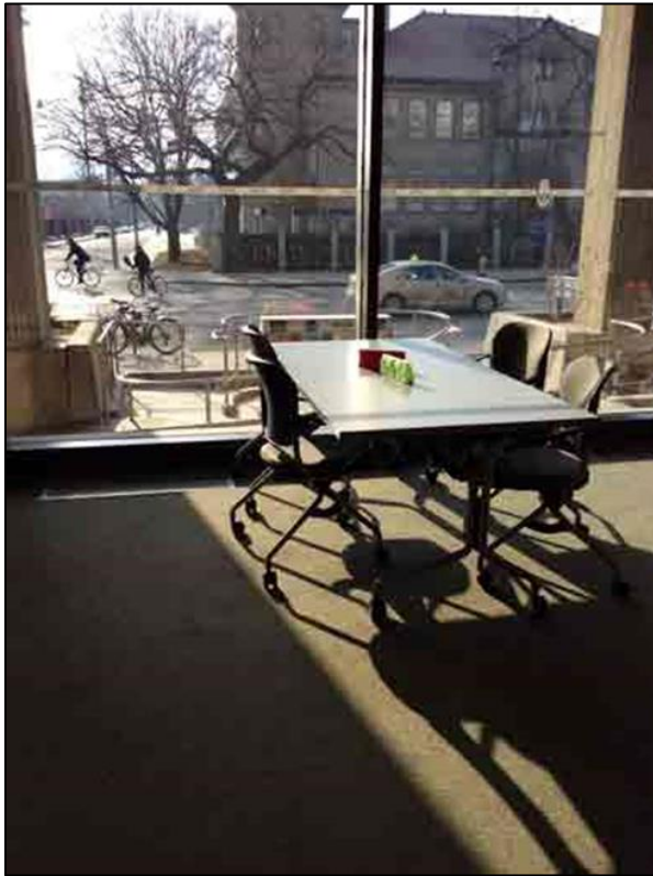
Figure 3 Participant 1's photo showing their favourite study spot in the OISE Library.

From reviewing the photos and interview data with each participant, the preliminary themes include furniture, technology, lighting, artwork, and group learning space. Within these themes there was much discussion about how each aspect was working within each category, and also how each could be improved to make the student experience even better. Although there is much to share and highlight from the results, I will limit the discussion to only two of the themes: furniture and lighting.