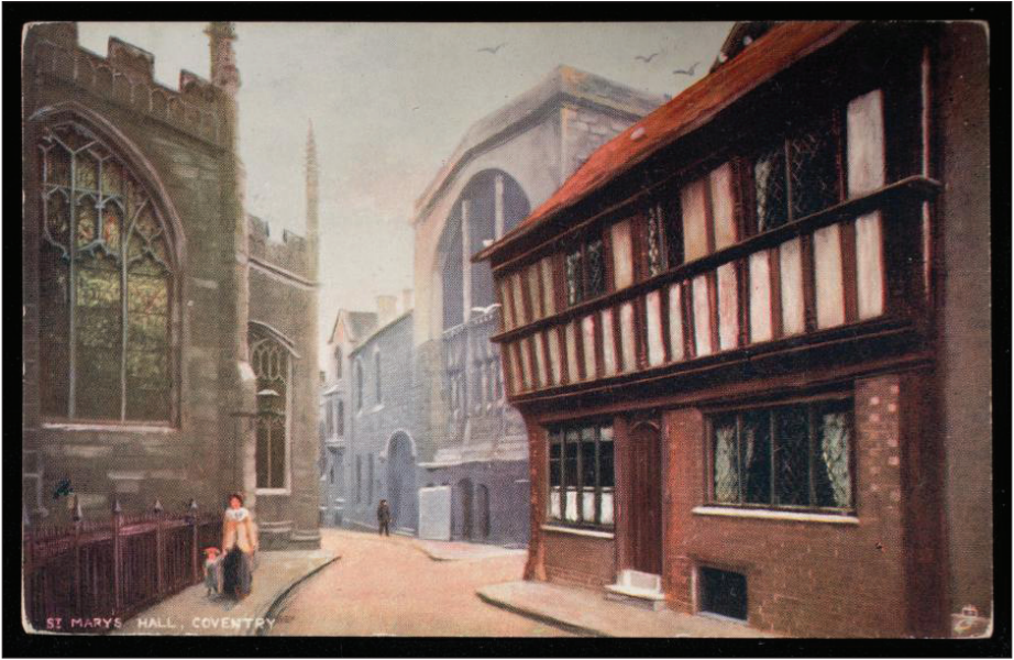
Figure 1: Pre-war postcard of Bayley Lane, Coventry. St Mary's Guildhall is in the background; the cathedral is on the left. Image: 'St Mary's Guildhall', open access licensed; courtesy of the Newberry Postcard Collection.

keeping. 78 After the war Coventry established an official City Record Office (CRO) and the collections were returned to the Muniment Room in St Mary's Hall. In 1957, the CRO, along with its records, moved to a new location in the basement of a building at 9 Hay Lane. 79 The records were moved several more times after this, first in 1979 to a temporary storage facility in Broadgate House, then again in 1986 to the newly established Central Library. 80 Finally in 2009, they were moved to the Herbert Art Gallery and Museum, where they remain today.