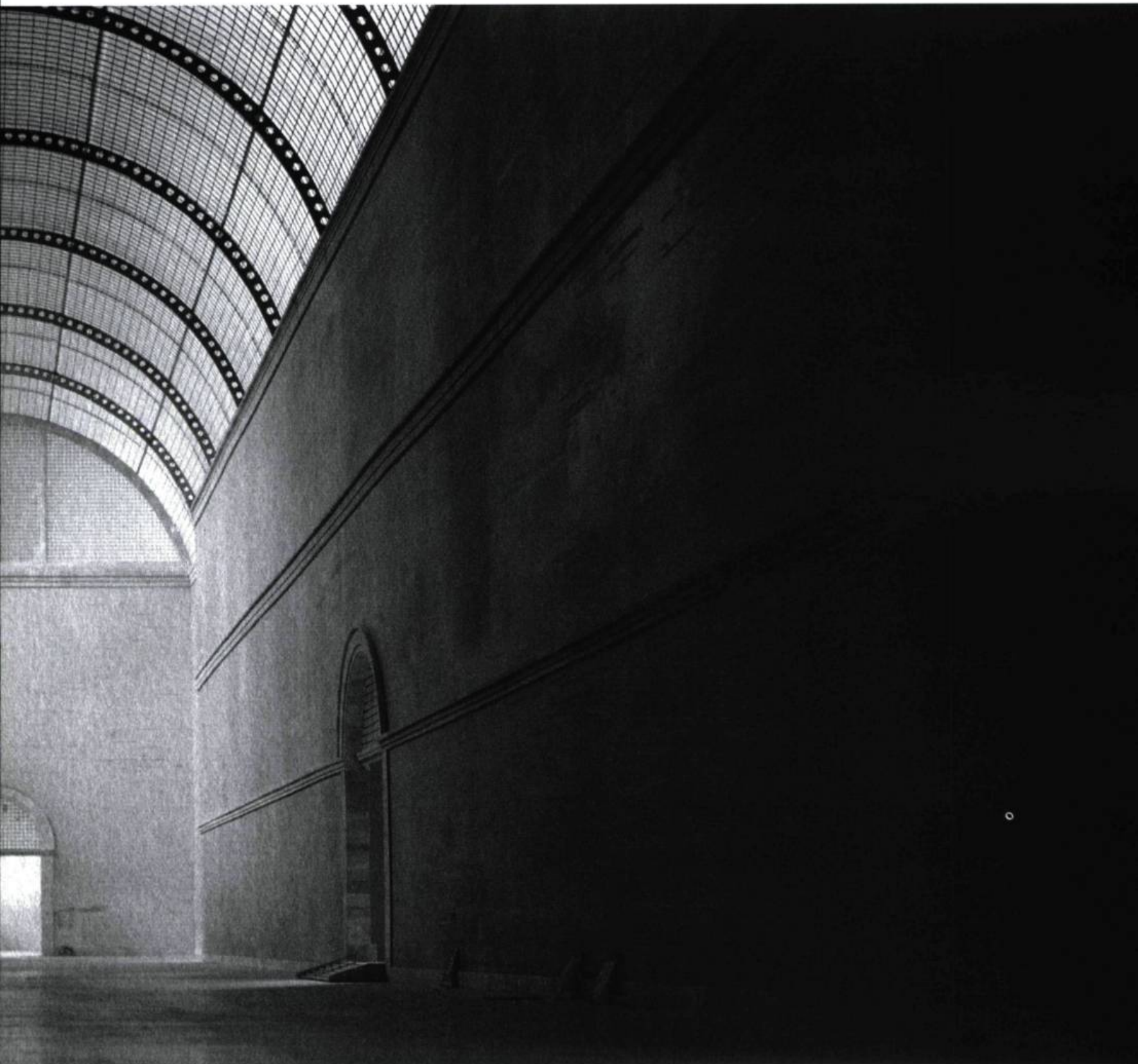
Great Hall Mausoleum, Birmingham, England from Landmarks of Industrial Britain digital print 2000