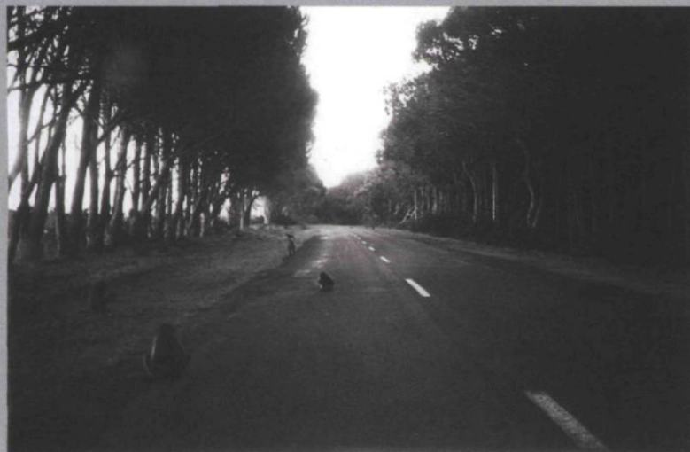
Wolfgang Tillmans, Tiere , 2005, C print, 144,8 x 213,4 cm, Courtesy Andrea Rosen Gallery (New York).

55th Carnegie International Pittsburgh, Pennsylvania, May 3, 2008–January 11, 2009