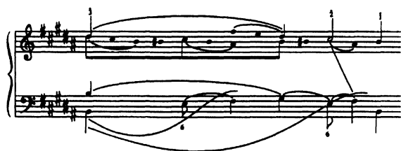
Figure 8: Middleground graph of bars 47–52

The song ends with a four-bar piano postlude over a sustained tonic harmony. The melodic line opens with the familiar ascent to the d\sharp , this time accomplished by means of an overlapping e , followed by a descent back to \hat{1} . Meanwhile a prominent inner part progresses f\sharp-g\flat-f\sharp , recalling that important motion from earlier in the song.