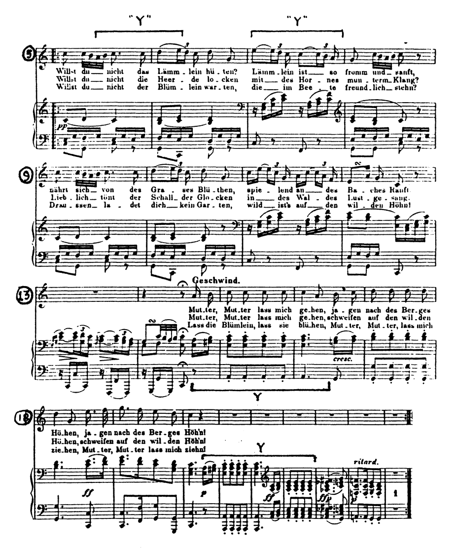
Example 3: Schubert, "Der Alpenjäger", mm. 5–26. Foreshadowing by arpeggiation