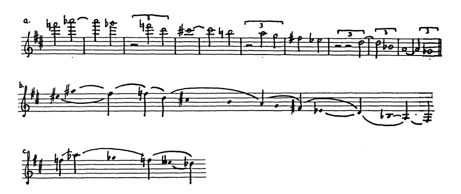
Example 9: Mahler, Ninth Symphony, first movement, mm. 423–433, flute part. Superimposed X and Y arpeggiations

found near the end of the first movement (mm. 423–433, see Example 9a). The melody as a whole can be heard as a highly ornamented arpeggiation of X (see Example 9b). The first portion, however, clearly outlines the Y triad as well, its root and fifth agogically accented (see Example 9c). Like all of the foreshadowing passages in the first movement, this one is rendered highly prominent, the melody played by the flute in a very high register over a rather static accompaniment.