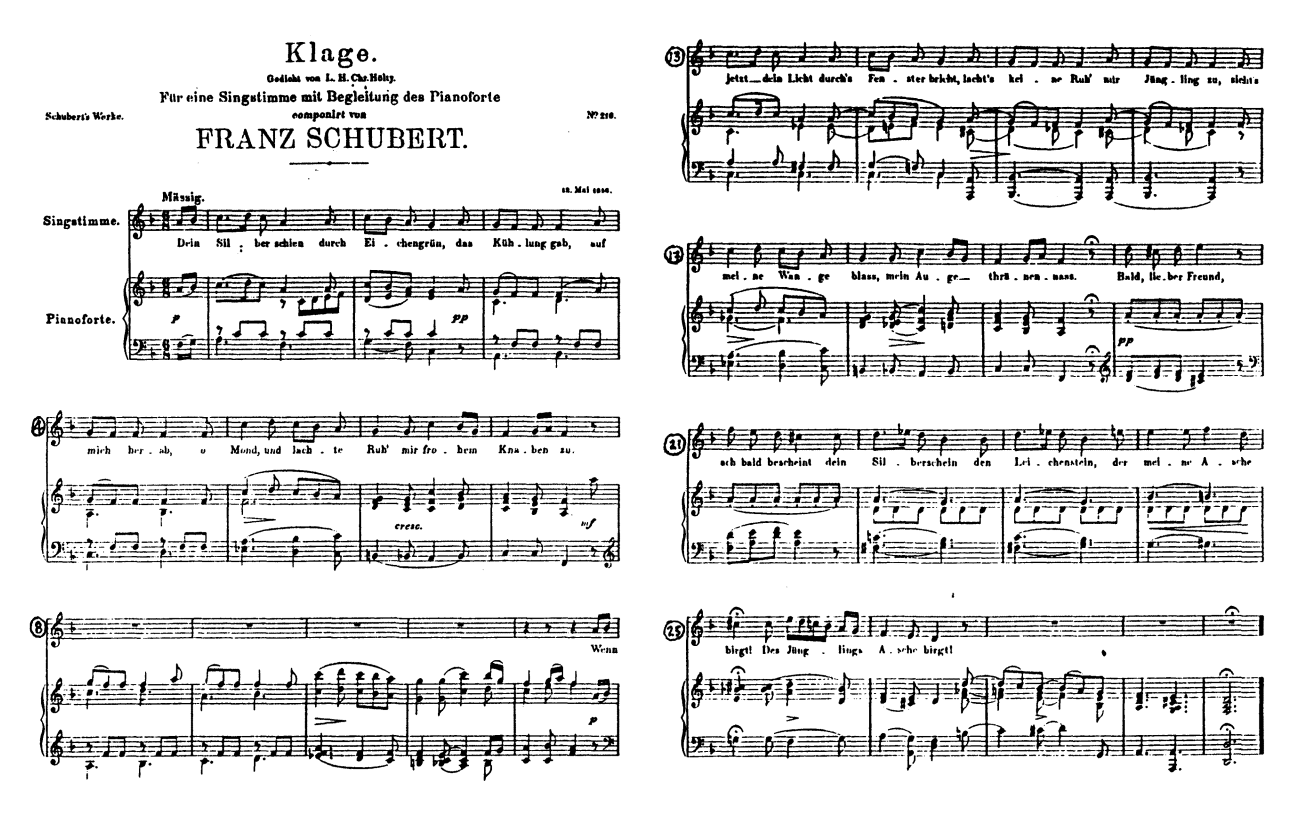
Example 1: Schubert, "Klage"