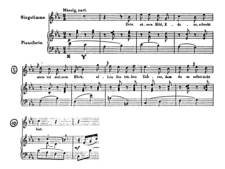
Example 5: Schubert, "Edone", mm. 1–11. Foreshadowing by juxtaposition of X and Y harmonies on two levels