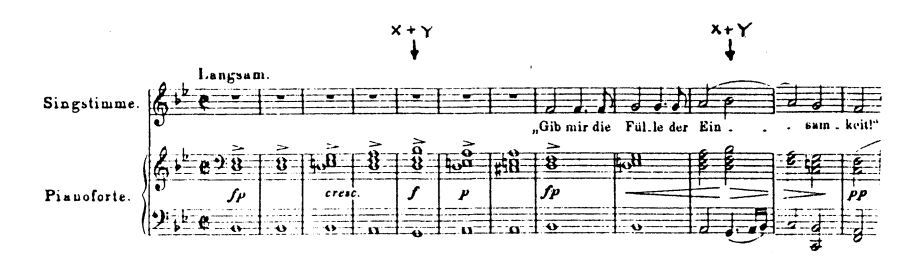
Example 6: Schubert, "Einsamkeit", mm. 1–12. Foreshadowing by superimposition of X and Y harmonies