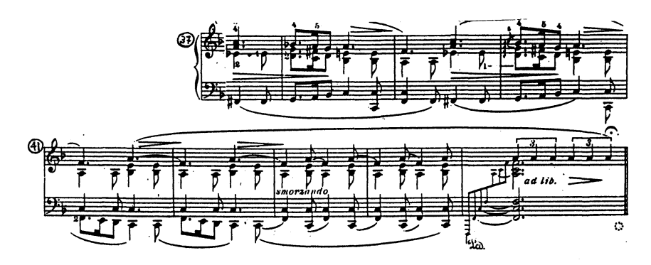
Example 4: Chopin, Ballade Op. 38, mm. 37–45. Foreshadowing by juxtaposition of the tonic notes of X and Y

vertical associations of X and Y, which are invariably dissonant and thus indicative of conflict.