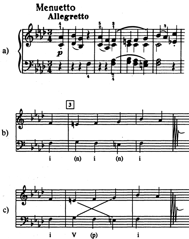
Figure 3. : Beethoven, Op.2(1)/III, mm. 1-4 :