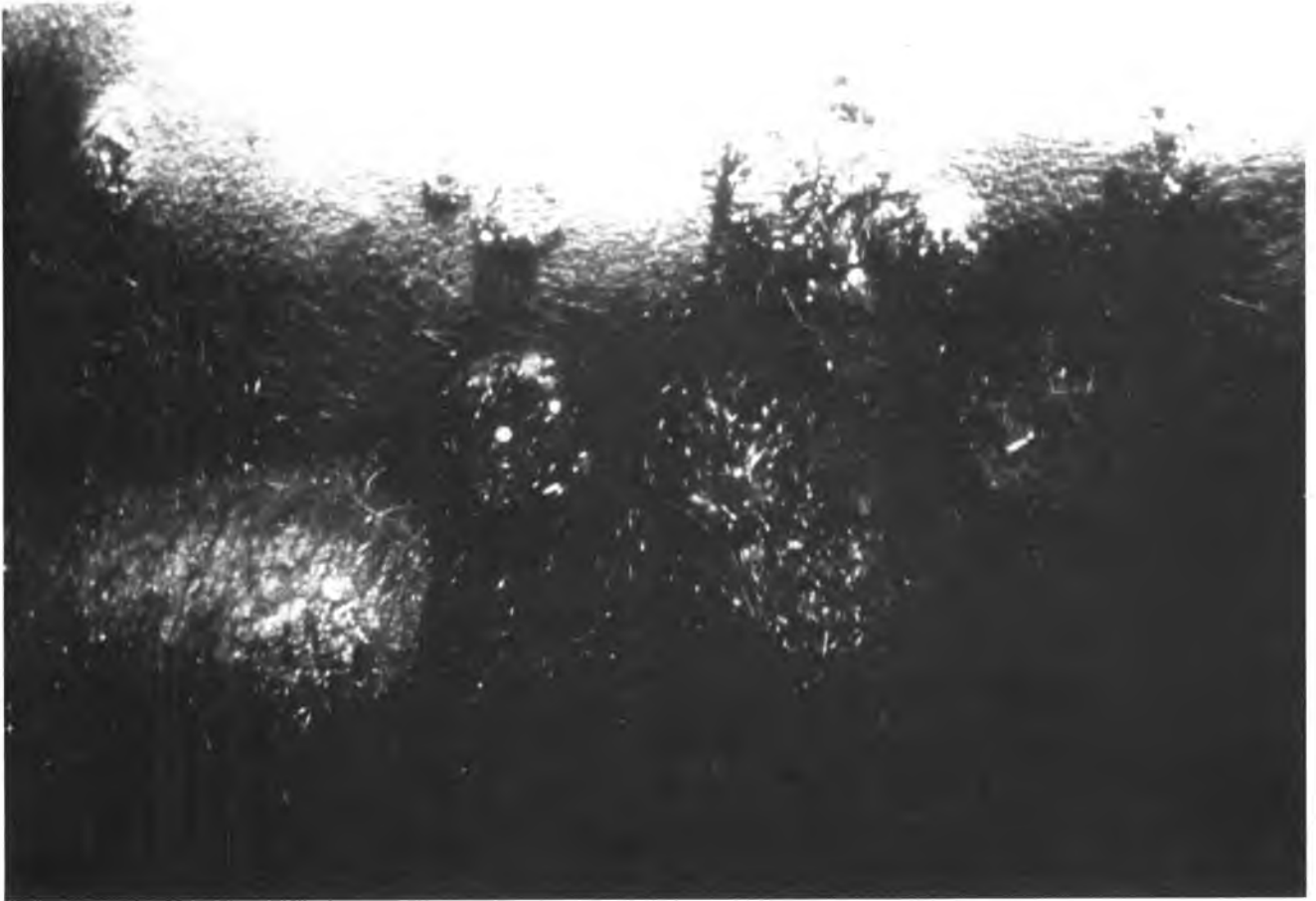
Figure 3: Subject #3, chest. Skin lifting off after sweat.