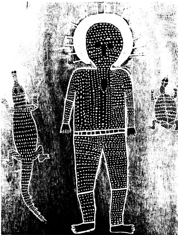
Figure 3. Wandjina Painting on Plywood made by Worora Aborigine in 1972.

2. At a more abstract level, the Wandjina and species paintings go beyond iconography and beyond their more mnemonic function of reminding people of the area’s mythology. As discussed above, the members of a clan are united by a spiritual bond in