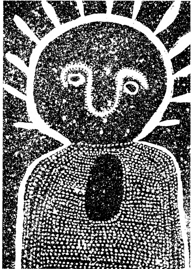
Figure 5. Wandjina Painting produced for the author in 1977.

A final example shows that the specific meaning of recently produced art forms has been revealed without erosion of the most subtle and fundamental aspects of West Kimberley cosmology. Interestingly, when Worora, Ngarinjin and Wunambal moved to Mowanjum in the 1950's, leaving their traditional homeland and their painted clan sites, they executed paintings of well-known Wandjina on the walls of the new community church. These Wandjina are now seen as representative of the three tribal groups living at Mowanjum, and their “fresh” shadows on the church wall provide the resident Aborigines with a sense of identity and continuity with their past. Through these art symbols, the oldest generation at Mowanjum has maintained its essential link with the Dreamtime and thus its belief in a changeless world. As Jensen writes for the Ngarinjin, contact with Western Civilization “has induced all kinds of changes in the external image of the culture, but the fundamental attitude toward the world has not been touched...” (1963: 126). Clearly this is true for older Kimberley Aborigines. Whether their distinctive cosmology can be successfully transmitted to yet another generation of Aboriginal children remains to be seen.