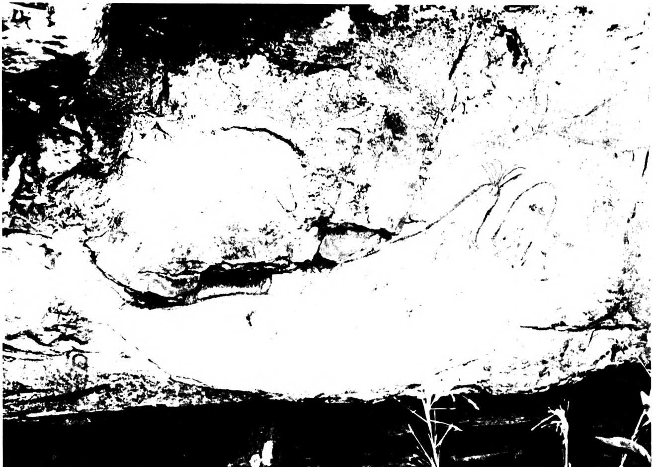
Figure 2. Turtle Painting in Cave in Ngarinjin Territory in Northwest Australia.

In addition to these moiety culture heroes, two