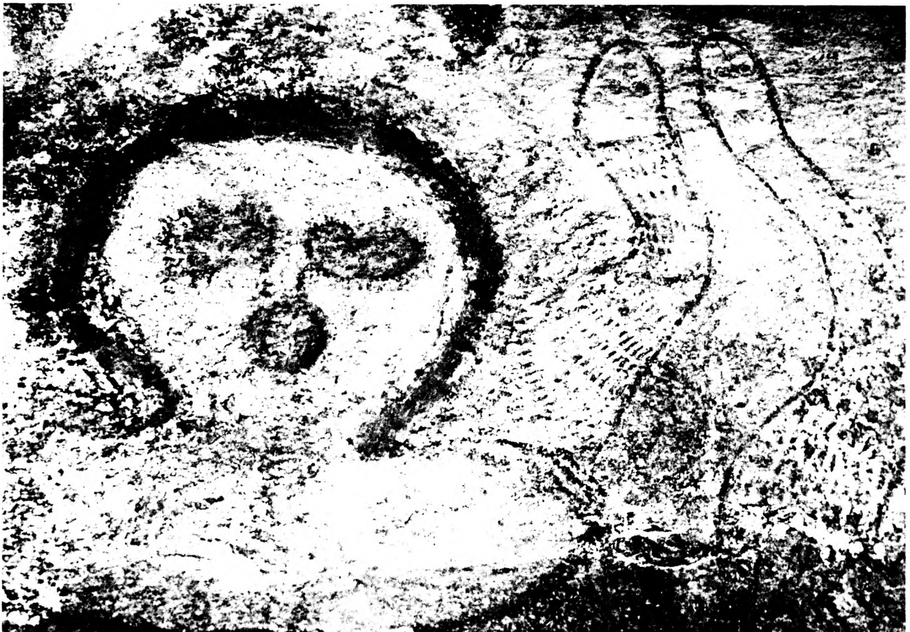
Figure 1. Wandjina and Snake Paintings in Cave in Ngarinjin Territory in Northwest Australia.

Cosmology: Kimberley Aborigines believe that the wunan was formed during the Dreamtime, which Worona call Lalai ( Lalan or Ungur in Ngarinjin; Urzeit in Wunambal). As elsewhere in Aboriginal